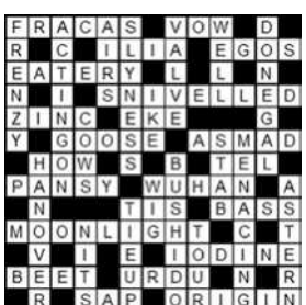
Solution to April 9