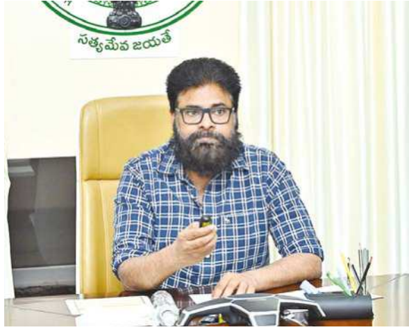
Dy CM Pawan Kalyan

that the newly launched drinking water scheme under the Jal Jeevan Mission would benefit around 30,000 people in 13 villages. As part of the project, a 10-acre pond has been developed along with a water treatment plant having a capacity of 3 million litres and an overhead tank. Water will be pumped from the Gannavaram canal and stored in the pond for supply.