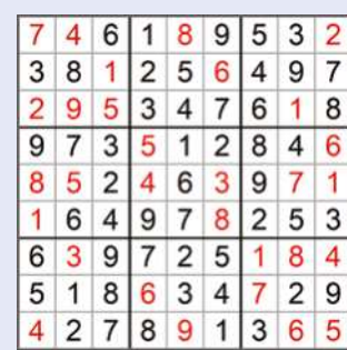
Solution to April 9