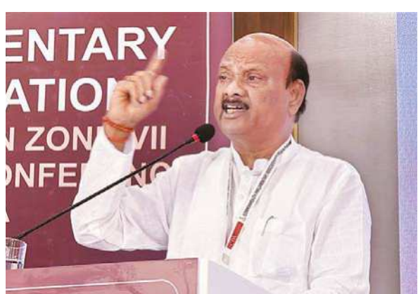
Assembly Speaker Ch Ayyanna Patrudu addressing

He stressed that for youth to contribute meaningfully they must first enter politics and succeed in legislative roles. However, prevailing political practices, including disruptions in legislatures and lack of decorum, discourage young aspirants. He called for exemplary conduct