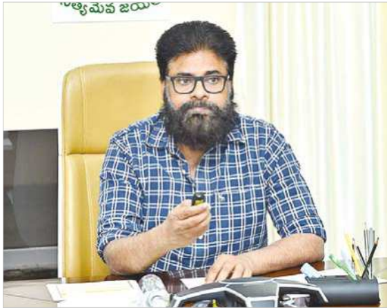
Dy CM Pawan Kalyan

"TRUE development is achieved not merely through construction activities but by improving basic infrastructure and bringing meaningful change in people's lives", Deputy Chief Minister Konidela Pawan Kalyan said on Thursday. He stressed the need to instil confidence and provide security for the future of citizens. He was speaking while virtually inaugurating and laying foundation stones for several development works in the Razole constituency. A major drinking water project constructed at a cost of Rs 17.33 crore at Antarvedi was inaugurated on the occasion. He also laid the foundation stone for rapid sand filter units with a capacity of 6 million litres, being taken up with Rs 5 crore from ONGC funds.