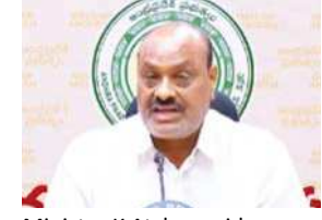
Minister K Atchanna speaking to media at the Secretariat on Thursday

Atchanna also alleged that even before YSR's death was officially confirmed, efforts were allegedly underway to mobilize support for Jagan's elevation as chief minister. He also referred to attacks on a private company establishments following allegations