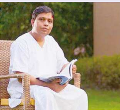
HANS NEWS SERVICE HARIDWAR

A task once abandoned midway as "impossible" by the world's leading health body has not only been completed in India but transformed into a historic achievement through sheer resolve.