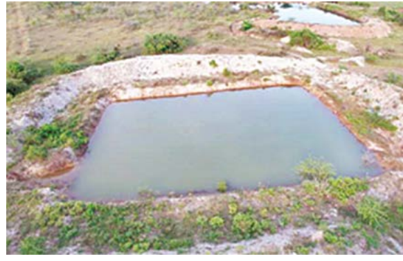
A water conservation structure in Marella

Thangella recorded the construction of 71 water conservation structures with a storage capacity of about 5.89 lakh cubic metres, supporting irrigation across 185.3 hectares, while the revival of traditional water bodies added around