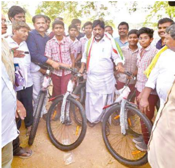
Deputy CM Bhatti Vikramarka Mallu distributing bicycles to schoolchildren in Madhira on Thursday

Speaking at a bicycle distribution programme organised by the Amma Foundation for students of government schools and colleges at Bonakal and Errupalem mandal headquarters in Madhira constituency of Khammam district on Thursday, he said, "Education is the true weapon for progress. Only through education can we build an equal and ideal society without disparities. Highlighting the