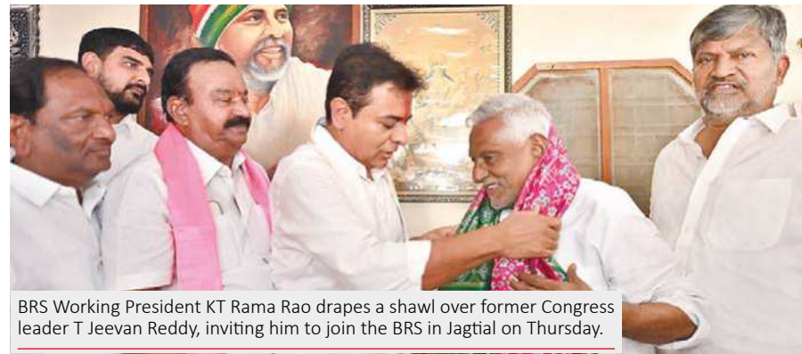
BRS Working President KT Rama Rao drapes a shawl over former Congress leader T Jeevan Reddy, inviting him to join the BRS in Jagtial on Thursday.

Several party leaders and public representatives accompanied him during the visit. Talking to the media, Rama Rao said that Jeevan Reddy responded positively to the invitation. He said that Jeevan Reddy acknowledged his long-standing personal association with KCR and expressed happiness over the visit, adding that he would meet KCR soon and announce his decision within a couple of days. KTR emphasised that for farmers and the poor in the state to regain stability and happiness, KCR must return as Chief Minister. He said experienced leaders like Jeevan Reddy are essential for rebuilding Telangana's growth trajectory. Highlighting Jeevan Red-