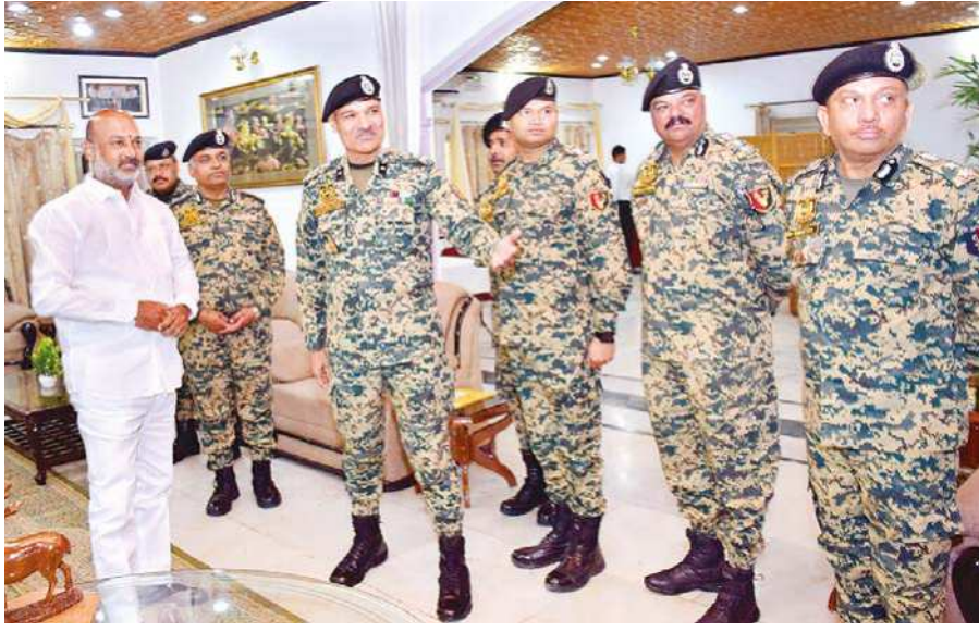
Union Minister of State for Home Affairs Bandi Sanjay Kumar interacts with Border Security Force personnel in Kashmir on Thursday