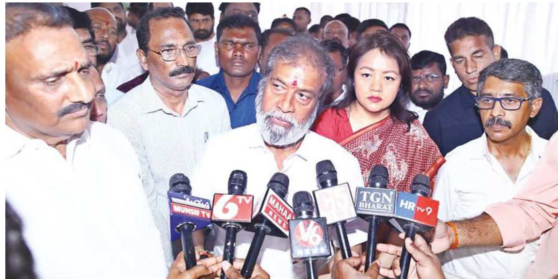
Health Minister Damodar Raja Narsimha speaking to the media in Hyderabad on Thursday

The works in Masab Tank include - reducing the width of the Sulabh Complex and shifting the bus shelter, land acquisition at NMDC and Dell Store (opposite S.D. Eye Hospital) for road widening as per the Master Plan, installation of height restriction barriers and warning boards on both sides of Masab Tank Flyover and shifting the electrical transformer at the Mehdiptan end of the flyover. And also, development of a slip road connecting - Pochamma Basti directly to Road No. 12.