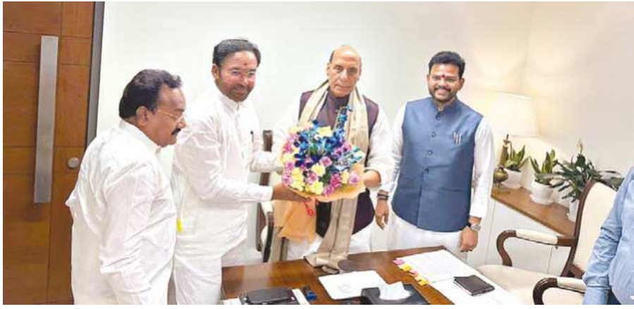
Union Minister G Kishan Reddy presents a bouquet to Defence Minister Rajnath Singh and Civil Aviation Minister Rammohan Naidu in New Delhi on Thursday. Civil Aviation Minister Rammohan Naidu is all smiles