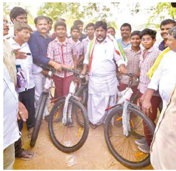
Deputy CM Bhatti Vikramarka Mallu distributing bicycles to schoolchildren in Madhira on Thursday

The Deputy Chief Minister announced that the government will soon roll out a breakfast scheme benefiting around 20 lakh students in government schools from June 2, noting that "No child should attend school on an