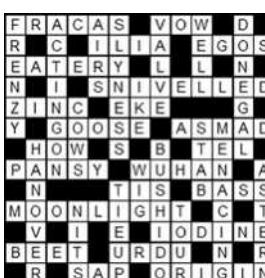
Solution to April 9