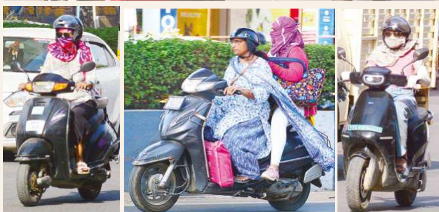
Bike riders shield themselves from hot sun by wrapping up their head with scarves in Hyderabad on Thursday