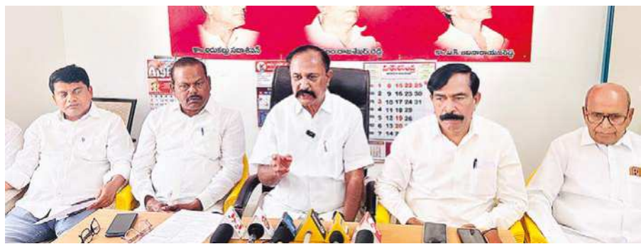
CPI leaders address a press conference at the party district office in Anantapur, announcing a padayatra from April 10 to 12 demanding continuation of the rural employment guarantee scheme