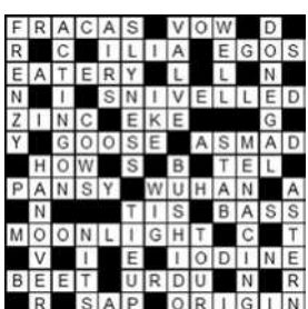
Solution to April 9