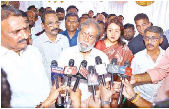
Health Minister Raja Narasimha laid the foundation stone for construction of a 100-bed critical care unit in Hyderabad on Thursday

He said the State government is strengthening the emergency response system