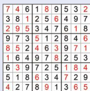
Solution to April 9