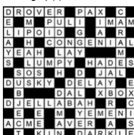
Solution to April 8