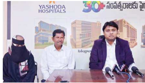
HANS NEWS SERVICE KARIMNAGAR