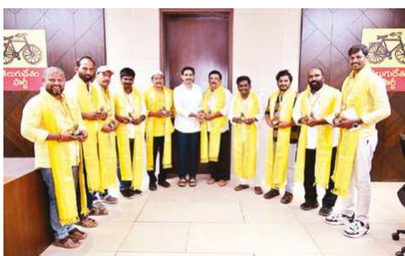
Education minister Nara Lokesh honours top 10 performers on My TDP app, at the party state office in Mangalagiri on Wednesday

lack of organisational activity in recent weeks by some legislators.