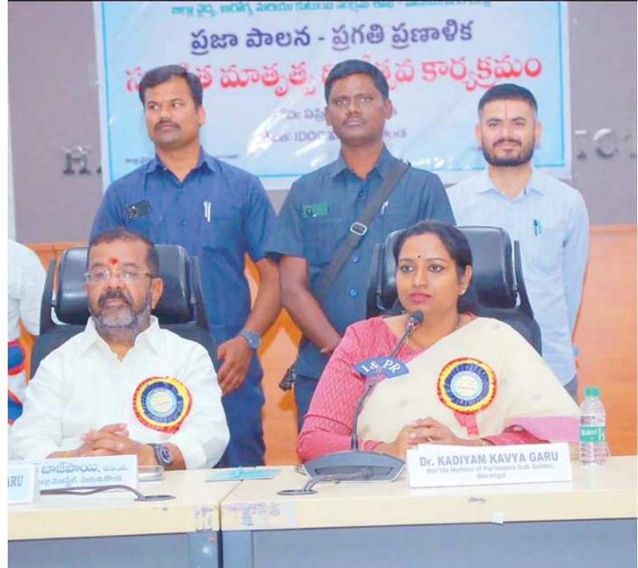
Warangal Member of Parliament Kadiyam Kavya at the Safe Motherhood Day programme in Hanumakonda district on Wednesday

WARANGAL Member of Parliament Kadiyam Kavya stressed the urgent need for widespread awareness on women's health issues during the Safe Motherhood Day programme held in Hanumakonda district on Wednesday.