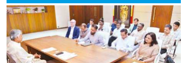
Chief Minister N Chandrababu Naidu with World Bank delegation at the Secretariat on Wednesday

world-class infrastructure, Amaravati is likely to become a major hub for commercial and economic activities in the state.