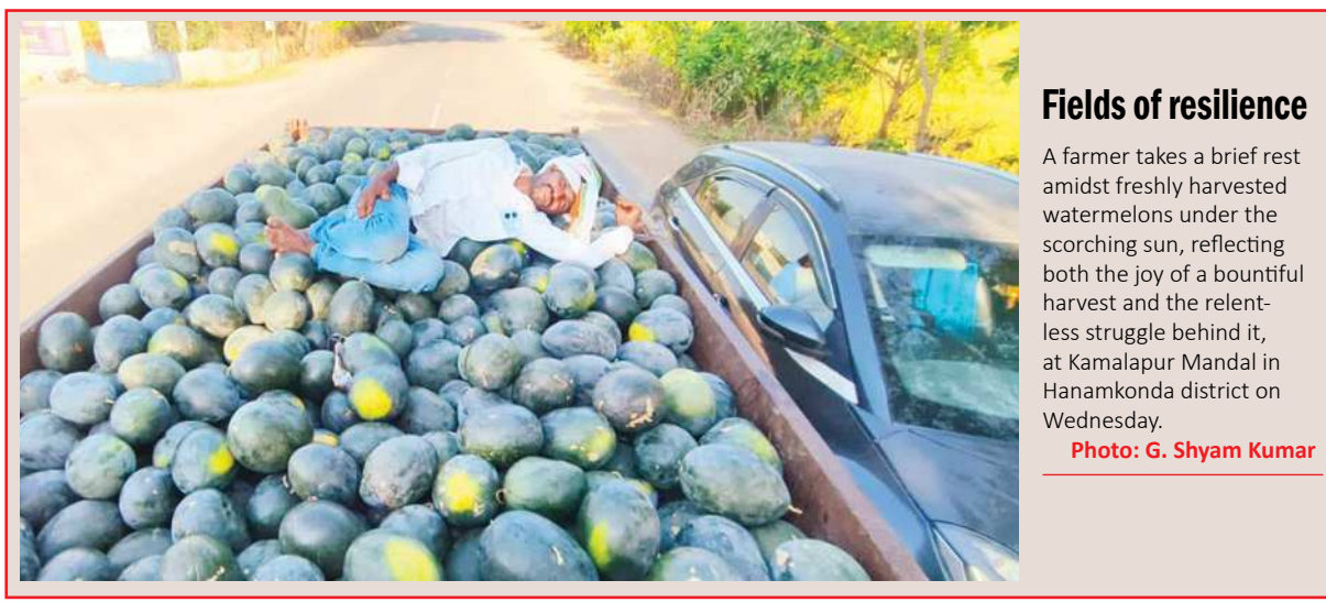
Fields of resilience

at the District Government General Hospital. During an inspection visit on Wednesday in Nirmal town, the Collector reviewed the nearly completed Emergency Medical Services block at the hospital premises. Officials presented construction plans and briefed her on completed works and pending tasks.