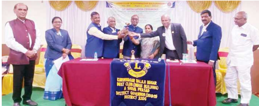
Installation ceremony of the Lions Club of Balajinagar in Karimnagar.

THE Lions Club of Karimnagar Balajinagar had conducted its 14th Installation Ceremony in a grand manner on Tuesday evening at Srinidhi Chits Conference Hall in Jyothinagar.