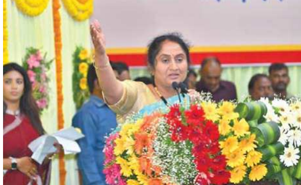
Minister for BC Welfare and Handlooms S Savitha addressing an awareness meeting at Acharya Nagarjuna University on Wednesday

MINISTER for BC Welfare, EWS Welfare, Handlooms and Textiles S Savitha called upon youth to emerge as entrepreneurs and generate employment opportunities for others. She stated that Chief Minister N Chandrababu Naidu's vision is to develop at least one entrepreneur from every household. She assured that the govern-