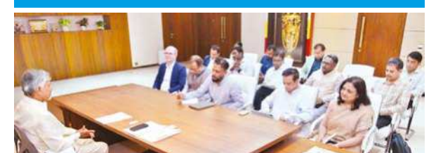
Chief Minister N Chandrababu Naidu with World Bank delegation at the Secretariat on Wednesday

world-class infrastructure, Amaravati is likely to become a major hub for commercial and economic activities in the state.