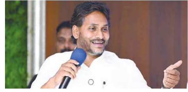
YSRCP chief Y S Jagan Mohan Reddy addressing party leaders from Tadepalligudem constituency at party central office in Tadepalli on Wednesday

YSRCP president Y S Jagan Mohan Reddy has once again reiterated his stand in the Amaravati vs MAVIGUN capital controversy, making it clear that he is not backing down from opposing Amaravati as the state capital. Advocating the MAVIGUN (Machilipatnam-Vijayawada-Guntur) model, Jagan termed it a more practical and cost-effective alternative.