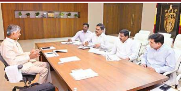
Chief Minister Nara Chandrababu Naidu at a review on R&B department in the Secretariat on Wednesday