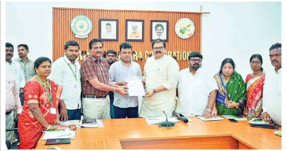
Agreements being handed over to agency representatives

He also highlighted the difficulties faced by around 400 home guards who have been working far away from their native places since the state bifurcation. He requested the government to initiate mutual transfers between Andhra Pradesh and Telangana to address their concerns and provide relief to the affected personnel.