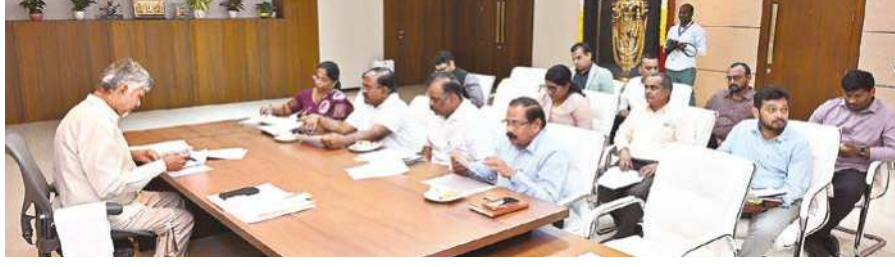
Chief Minister N Chandrababu Naidu holds a review on revenue department at the Secretariat on Wednesday