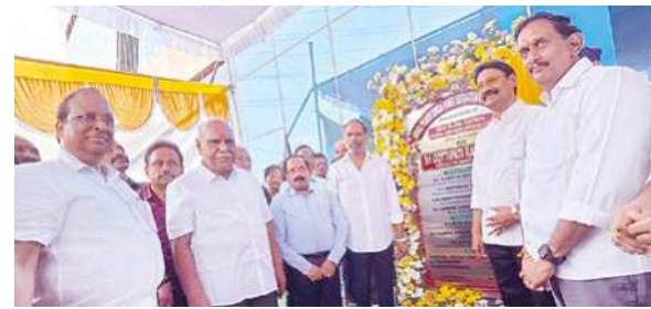
Energy minister Gottipati Ravi Kumar inaugurates the new corporate office of APCPDCL at Gunadala in Vijayawada on Wednesday

He said that construction of new substations is progressing rapidly across the state. Following the directions of Chief Minister N Chandrababu Naidu, the government is focused on providing uninterrupted quality power supply without increasing electricity tariffs. He emphasised that there should be no power disruptions or low-voltage issues, and officials are working dili-