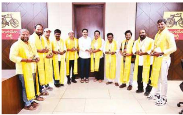
Education minister Nara Lokesh honours top 10 performers on My TDP app, at the party state office in Mangalagiri on Wednesday

lack of organisational activity in recent weeks by some legislators.