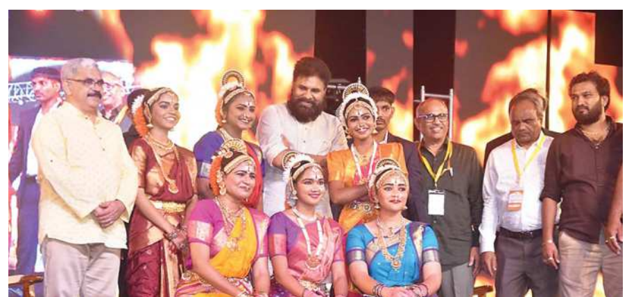
Deputy Chief Minister K Pawan Kalyan along with artistes at the centenary celebrations of Andhra University in Visakhapatnam on Wednesday