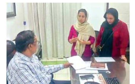
Two Iranian students briefing their distress to the revenue officer in Visakhapatnam on Wednesday

The representation further noted that the family had been unable to pay rent for the past two months, amounting to Rs.14,600, while pending school fees for their three children was Rs.29,700. The students also indicated that they required fi-