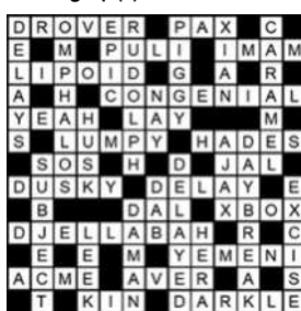
Solution to April 8