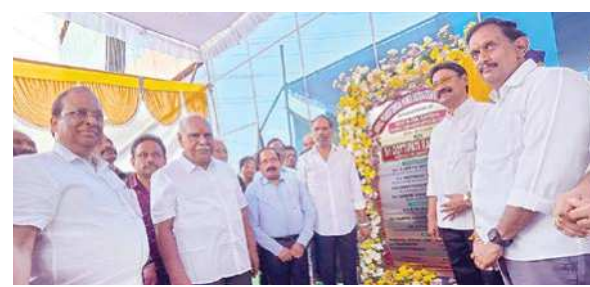
Energy minister Gottipati Ravi Kumar inaugurates the new corporate office of APCPDCL at Gunadala in Vijayawada on Wednesday

He said that construction of new substations is progressing rapidly across the state. Following the directions of Chief Minister N Chandrababu Naidu, the government is focused on providing uninterrupted quality power supply without increasing electricity tariffs. He emphasised that there should be no power disruptions or low-voltage issues, and officials are working dili-