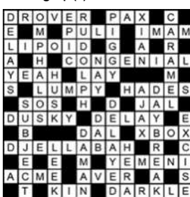
Solution to April 8