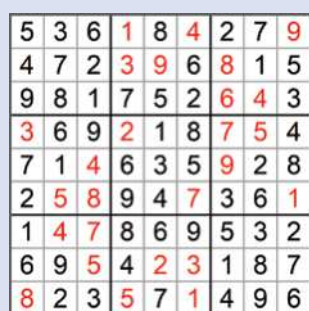
Solution to April 8