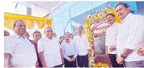
Energy minister Gottipati Ravi Kumar inaugurates the new corporate office of APCPDCL at Gunadala in Vijayawada on Wednesday

He said that construction of new substations is progressing rapidly across the state. Following the directions of Chief Minister N Chandrababu Naidu, the government is focused on providing uninterrupted quality power supply without increasing electricity tariffs. He emphasised that there should be no power disruptions or low-voltage issues, and officials are working dili-