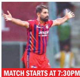
MATCH STARTS AT 7:30PM