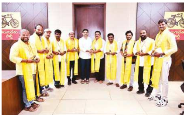
Education minister Nara Lokesh honours top 10 performers on My TDP app, at the party state office in Mangalagiri on Wednesday

lack of organisational activity in recent weeks by some legislators.