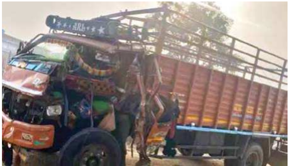
CHIVEMLA (SURYAPET)