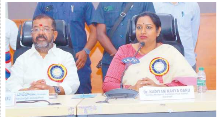
Warangal Member of Parliament Kadiyam Kavya at the Safe Motherhood Day programme in Hanumakonda district on Wednesday