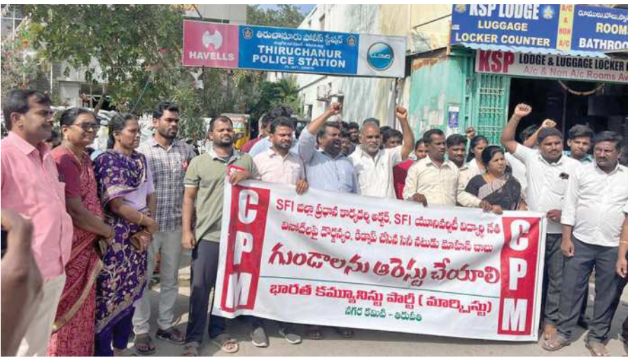
CPM leaders protesting before Tiruchanoor police station on Tuesday