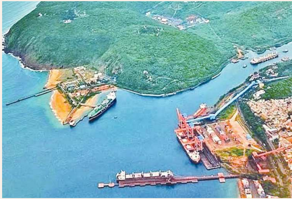
A view of Visakhapatnam Port