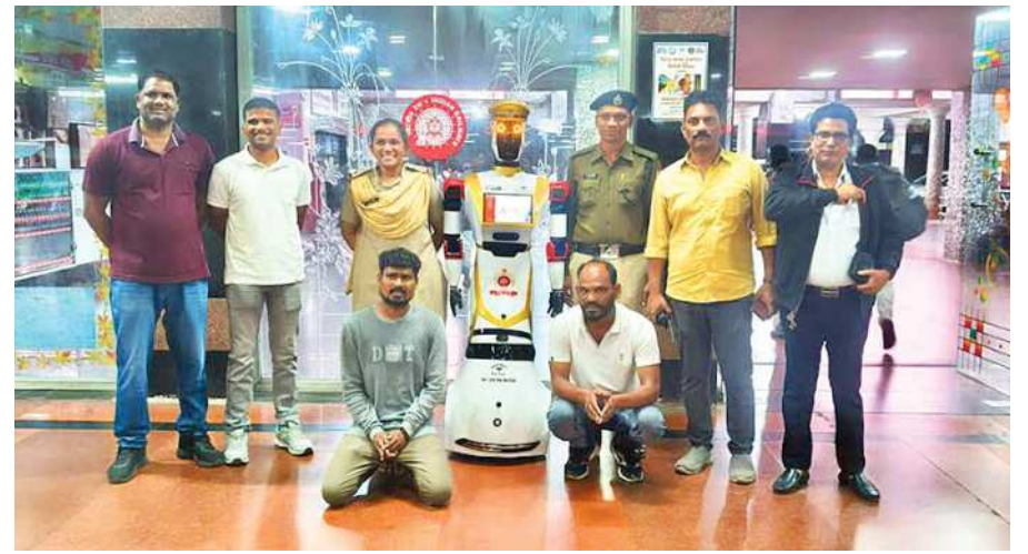
Rail robocop 'ASC Arjun' aids in nabbing two habitual offenders in Visakhapatnam on Tuesday

Setting ambitious targets, enhancing sustainable operations and reducing carbon emissions, Visakhapatnam Port is marching towards becoming a landlord port by 2030. With the port achieving 74.6 MMT cargo throughput so far for the financial year, the officials exude confidence that another 15.4 MMT is certain to be achieved in a little over 50 days to reach the 90 MMT target.