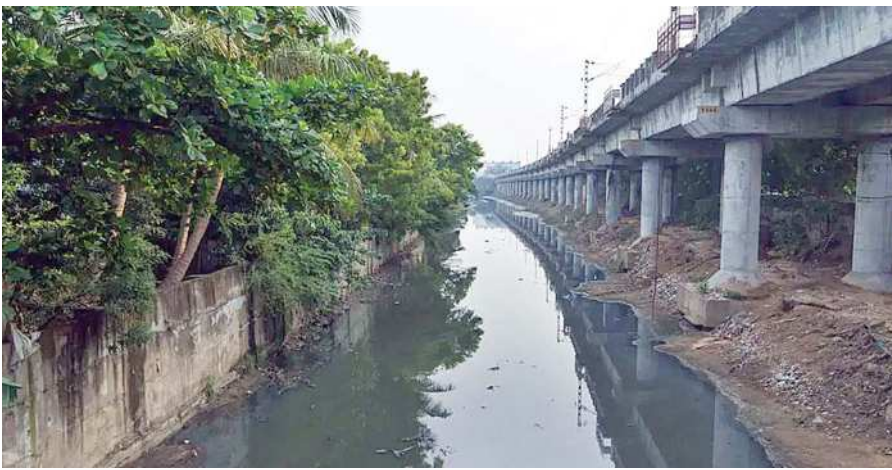
This historic canal, which used to be bustling with activity, is now ravaged with multiple problems like emitting untreated wastes by the industries and urban populates, encroachment of the canal land, siltation, and damage caused by natural disasters like floods. The mega prawn farms situated at the banks of this waterway dump their diseased and dead stock directly into the canal. Cyclones, against which this canal acted as a buffer zone, have damaged the canal and only a few attempts have been made towards the reconstruction and maintenance of the canal

has placed erstwhile Madras Presidency “in cheap and easy communication with no less than five districts, and with the large and important towns of Cocanada, Bezwada, Masulipatam, Ongole and Nellore”. This canal earlier was “a dreary waste of sand, but much of this barren and arid country has been greatly developed and improved owing to the remarkably cheap means of communication afforded by the canal; cultivation has been brought into existence or extended, owing to the facilities given by the canal for the drainage of low-lying land; numerous casuarina and other plantations have been formed along its entire length; a great increase in the wealth and prosperity of the population has taken place”. Beyond bringing prosperity for the people in the region, this canal has the potential to protect people against natural disasters like floods and tsunamis. The canal has mitigated the effects of the 2004 Tsunami by acting as a buffer zone for 310-km long coastal regions