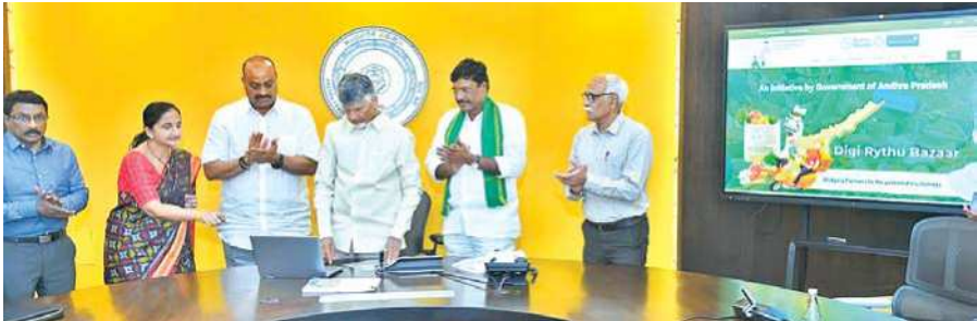
Chief Minister N Chandrababu Naidu launches apps related to agriculture at a review on agriculture and allied sectors at the Secretariat on Tuesday

CHIEF Minister N Chandrababu Naidu on Tuesday directed officials to launch a comprehensive programme to make Andhra Pradesh the country's largest natural farming State. He said 1.8 million farmers were currently practicing natural farming on two million acres and set a target of covering four million farmers and five million acres by 2030-31. Reviewing agriculture and allied sectors at the Secretariat, Naidu stressed the need to reduce the use of chemical fertilisers to cut cultivation costs and improve farmers' incomes. He called for certi-