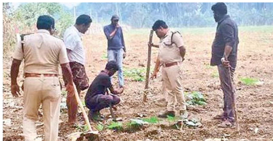
Forest staff inspecting tiger's pugmarks in Seethanagaram mandal