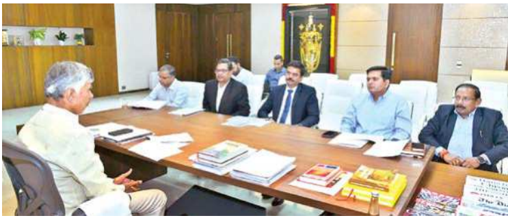
Chief Minister N Chandrababu Naidu holds a review on Visakhapatnam steel plant at the Secretariat on Tuesday