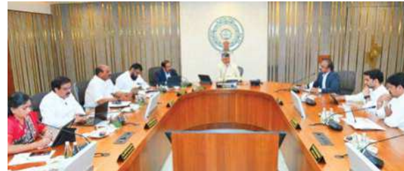
Chief Minister N Chandrababu Naidu chairs Cabinet meeting in Amaravati on Tuesday