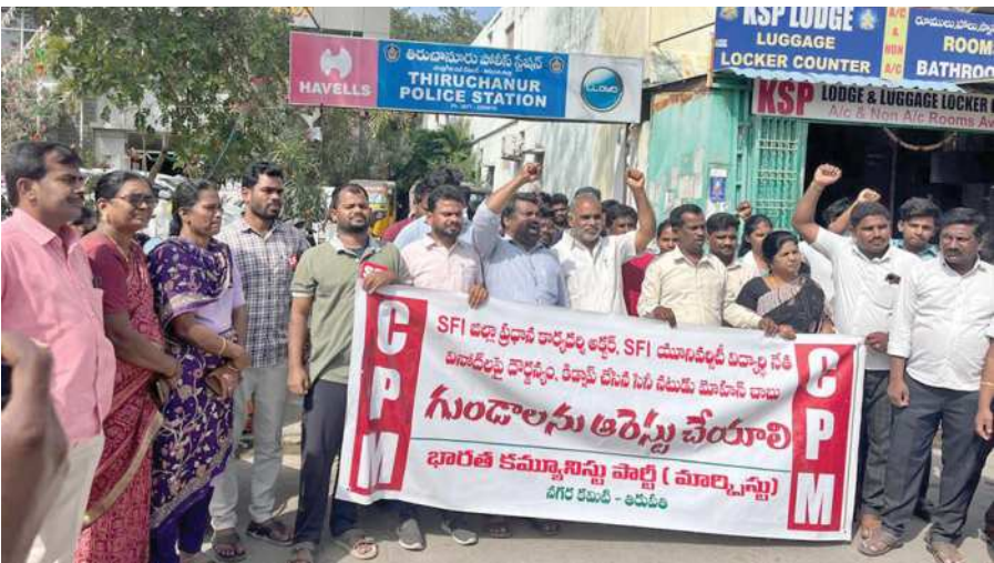
CPM leaders protesting before Tiruchanoor police station on Tuesday