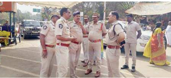
Nandyal SP Suneel Sheoran inspecting traffic parking locations in Srisaillam on Tuesday