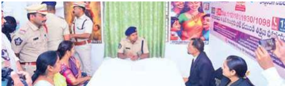
Police officials interact with women during a counselling session at the newly inaugurated Family Counselling Centre at Puttaparthi in Sri Sathya Sai district on Tuesday

Speaking on the occasion, the SP said the police department would extend all possible support to women approaching the centre and work towards resolving their grievances through counselling. He noted that after revenue-related issues, family disputes account for a significant number of complaints received through grievance platforms. To address this, a dedicated counselling team comprising