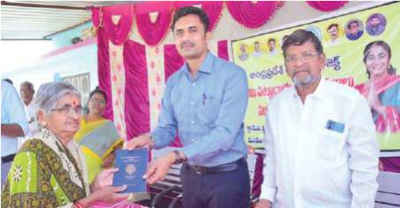
Collector A Shyam Prasad distributing a newly issued pattadar passbook to a farmer during a land records distribution programme held at Javakuladinne village in Gorantla mandal on Tuesday

Addressing the gathering, the Collector said the government is distributing authenticated Pattadar Passbooks across all villages in the district to strengthen land ownership security and improve transparency in land records. He cautioned that many land-related disputes arise due to the failure to conduct proper surveys at