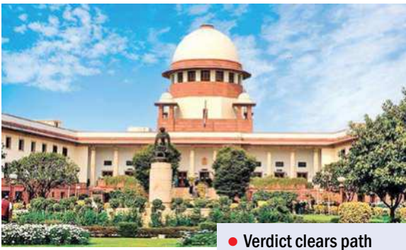
HYDERABAD/NEW DELHI