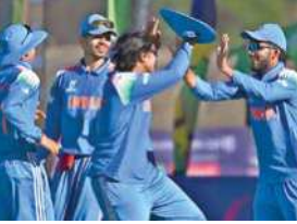
Match starts at 1 pm IST

Going by form and overall composition, India will hold an edge over the Afghans in the knock-out game. Wicket-