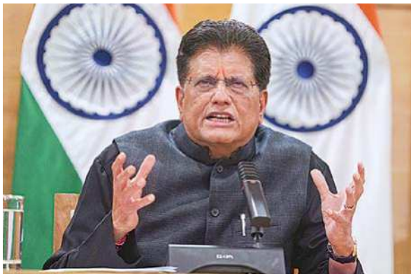
Union Commerce Minister Piyush Goyal addressing the media on the progress of the India-US trade deal in New Delhi on Tuesday