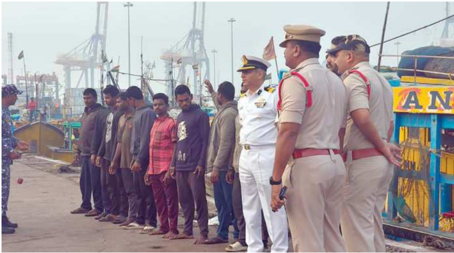
Fishermen who were detained in Bangladesh reached Visakhapatnam safely on Monday

The fishermen reached the harbour by fishing vessel IND-APV5-MM-735. Among them, nine fishermen from North Andhra