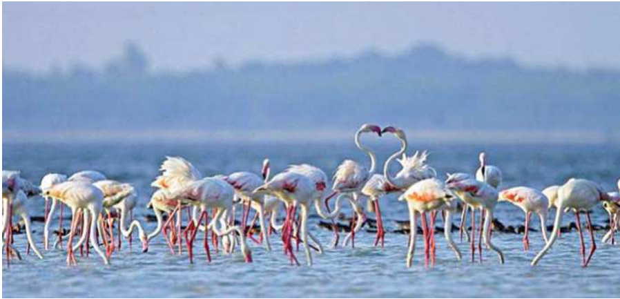
Flamingos at Pulicat lake

A major highlight for the district is the Centre's decision to develop Pulicat Lake as a