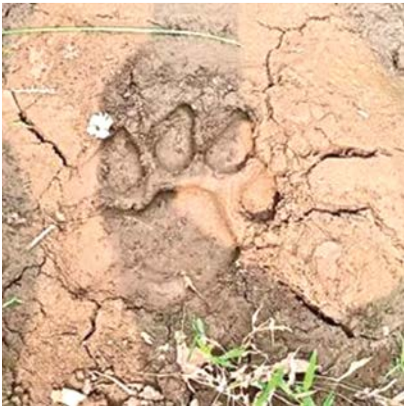
The tiger's pugmarks near banana plantation at Thorredu of Rajamahendravaram Rural mandal