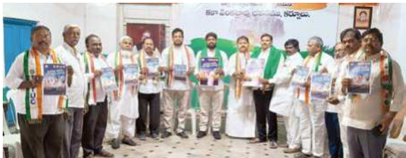
Congress leaders releasing posters of Employment Guarantee Protection Yatra in Kurnool on Monday