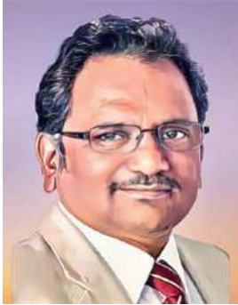
PROF MADABHUSHI SRIDHAR ACHARYULU

YEARS back, every village and settlement had a lake—protected by a raised embankment, a katta. The lake was not merely a water body but a living institution. Its embankment was guarded by local deities—Katta Maisamma, Gandhi Katta Maisamma, Pochamma—symbols of collective memory and ecological discipline. The deity stood there as a reminder and a silent message—do not breach the bank, do not pollute the water and do not encroach upon the commons. Cut to the present times. At most places, the lake is gone. The embankment is gone. But the deity remains. Massive temples have replaced modest shrines. Expensive cars are driven in for rituals. Lemons are tied, pumpkins broken and garlands draped. There is a ticket for the vehicle and another for Ashtottara. Water is sprinkled to complete the ritual—often drawn not from the vanished lake, but from a purchased plastic “water bubble.” Faith without water, development without life: Faith continues. Ecology does not. This is not a criticism of belief. Every society has its rituals. Even rockets sent into space are adorned with lemons, ginger,