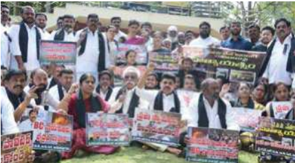
YSRCP leaders and activists staging a protest in Anantapur on Monday