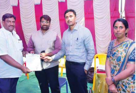
District officials handing over orders removing Prasanthi Nagar residential land from the Section 22A prohibited list