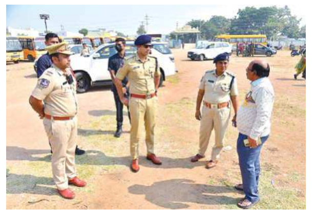
CP Gaush Alam inspecting security for third phase of panchayat elections in Karimnagar on Tuesday

The CP stated that approximately 877 police personnel are being deployed for election security. This includes 6 ACPs, 20 Inspectors, 39 SIs, 40 ASIs/head constables, 460 constables, 35 Special Action Team police personnel, 178 Home Guards, along with 100 Battalion Special Police personnel. Additionally,