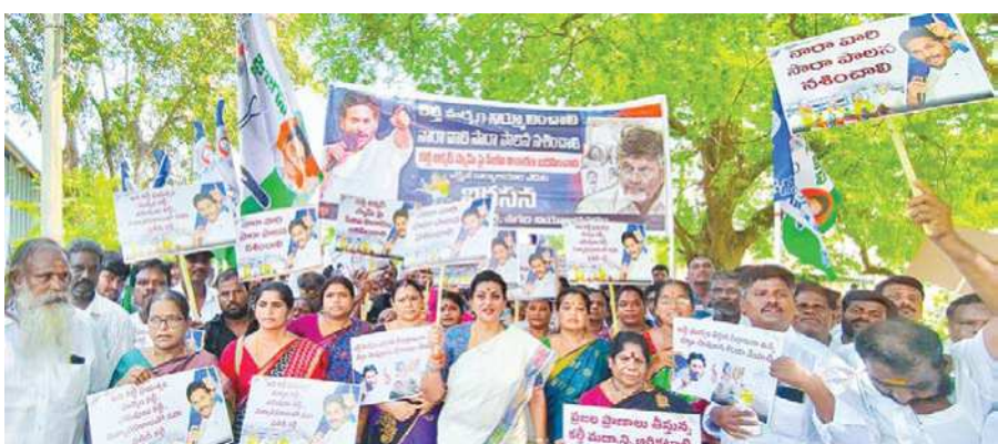
Former minister RK Roja leading a rally in Nagari on Monday

Rao alleged that the manufacture of counterfeit liquor began during the tenure of the previous government under Ramesh's supervision. He claimed that in April this year, Ramesh allegedly instructed him to restart the operation to malign the image of the current government. According to Rao, the initial setup was planned in Ibrahimpatnam, but the location was later shifted to the Thamballapalle constituency on Ramesh's directions.