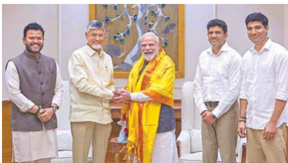
Chief Minister N Chandrababu Naidu meets PM Narendra Modi along with Union Civil Aviation Minister Kinjarapu Ram Mohan Naidu and others in New Delhi on Monday

Designed to house the CRDA, Amaravati Development Corporation Limited, and all the wings of the Municipal Department