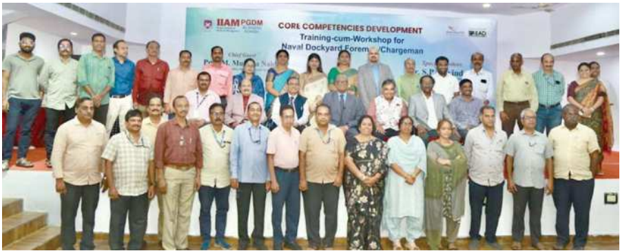
Dockyard foreman and charge man at the workshop held in Visakhapatnam on Monday