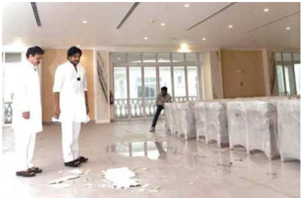
Deputy Chief Minister K. Pawan Kalyan and Civil Supplies Minister Nadendla Manohar looking at the damaged false ceiling that fell on the floor during their recent visit to Rushikonda palace in Visakhapatnam

For the past few years, the Rushikonda palace turned out to be a big puzzle for the NDA government as it did