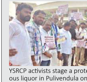
YSRCP activists stage a protest against alleged sale of spurious liquor in Pulivendula on Monday