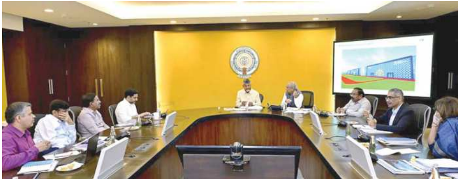
Chief Minister N Chandrababu Naidu chairs a review meeting on the CII Partnership Summit in Visakhapatnam, at the Secretariat on Monday

vember 14–15 event should project Andhra Pradesh as a leading destination for innovation, technology and industry. He announced plans to invite Prime Minister Narendra Modi, global business leaders, and top CEOs to the summit. "The summit must strengthen global trust, drive trade partnerships, and highlight the state's role in the global tech trans-