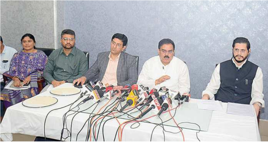
Minister for Civil Supplies Nadendla Manohar addressing the media in Visakhapatnam on Monday

He mentioned that these rapid kits will contain bottles of potassium thiocyanate and hydrochloric acid. He said that if these solutions are sprinkled on the fortified rice supplied by the government, it turns