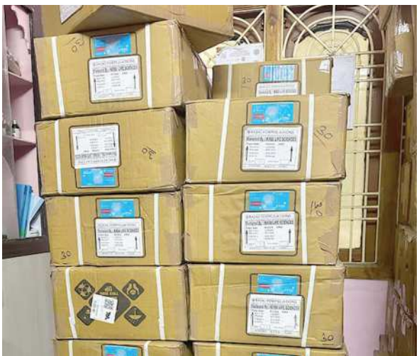
2 Seized prohibited cold and cough syrup boxes in Visakhapatnam on Monday

niramine Maleate plus Phenylephrine Hydrochloride have been prohibited for use among children below four years of age.