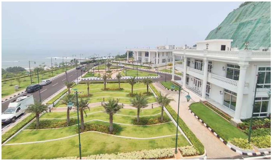
A view of Rushikonda project in Visakhapatnam