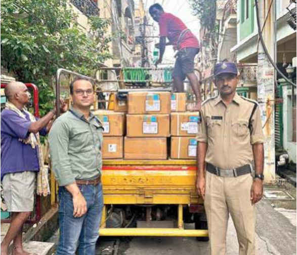
Drugs Control officials seizing the prohibited cold and cough syrups in Visakhapatnam on Monday

The syrups that contain a combination of Chlorphe-