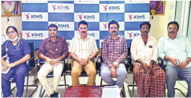
Doctors of KIMS, Nellore