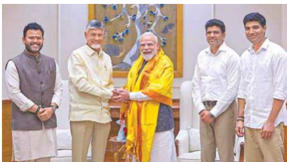
Chief Minister N Chandrababu Naidu meets PM Narendra Modi along with Union Civil Aviation Minister Kinjarapu Ram Mohan Naidu and others in New Delhi on Monday

Designed to house the CRDA, Amaravati Development Corporation Limited, and all the wings of the Municipal Department