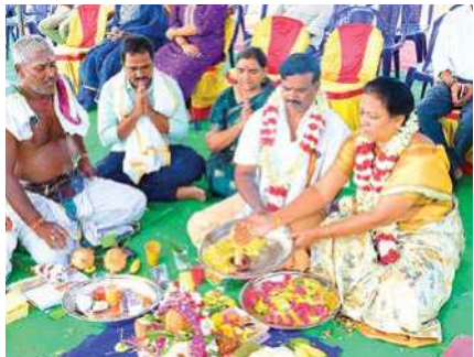
Bhumi Pooja being performed for the construction of Ayurvedic Hospital in Sri City on Monday