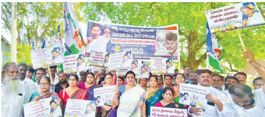
Former minister RK Roja leading a rally in Nagari on Monday

Rao alleged that the manufacture of counterfeit liquor began during the tenure of the previous government under Ramesh's supervision. He claimed that in April this year, Ramesh allegedly instructed him to restart the operation to malign the image of the current government. According to Rao, the initial setup was planned in Ibrahimpatnam, but the location was later shifted to the Thamballapalle constituency on Ramesh's directions.