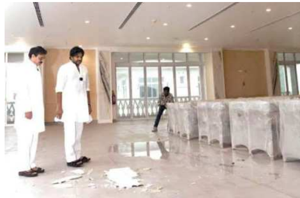
Deputy Chief Minister K. Pawan Kalyan and Civil Supplies Minister Nadendla Manohar looking at the damaged false ceiling that fell on the floor during their recent visit to Rushikonda palace in Visakhapatnam

For the past few years, the Rushikonda palace turned out to be a big puzzle for the NDA government as it did