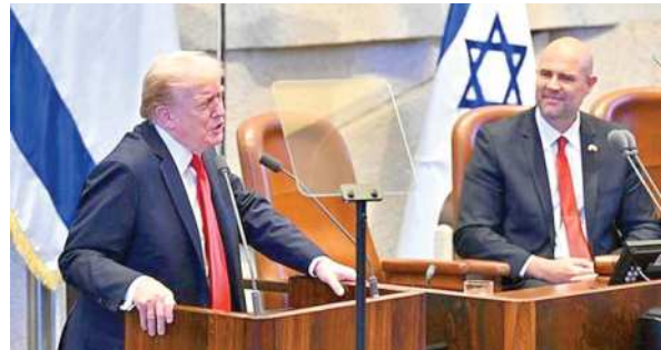
US President Donald Trump addressing the Knesset, Israel's Parliament, next to Amir Ohana, Speaker of the Israeli Knesset, in Jerusalem on Monday