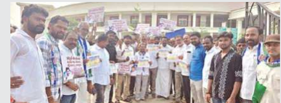
YSRCP activists stage a protest against alleged sale of spurious liquor in Pulivendula on Monday

The YSRCP demanded a thorough investigation into all bars, liquor shops, and belt (illegal) outlets, and urged a Central Bureau of Investigation (CBI) probe to identify those behind the spurious liquor network. The party also sought compensation for victims' families, immediate cancellation of licenses of illegal outlets, and strict enforcement against liquor sales near schools and public places.