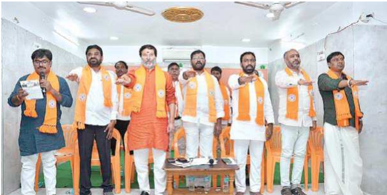
Participants at a workshop on Atmanirbhar Bharat in Tirupati on Monday