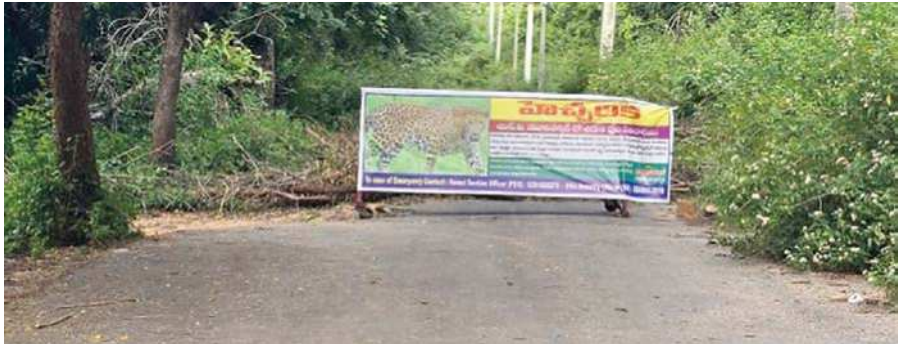
A flex banner on the SV University campus warning students and staff about leopard movements

AS wildlife experts had cautioned a couple of months ago when a leopard was trapped on Sri Venkateswara University (SVU) campus, the problem appears far from over. They had warned that the captured leopard might not be the only one roaming the area, and their words have now proven prophetic. Fresh sightings of a leopard around SV University and Sri Venkateswara Vedic University campuses have once again triggered panic among students, faculty, and residents, who are living in con-