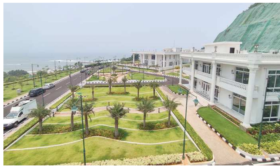
A view of Rushikonda project in Visakhapatnam