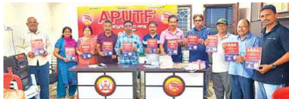
UTF district leaders distributing free study material to students appearing for the National Means-cum-Merit Scholarship examination in the district through its Mandal representatives