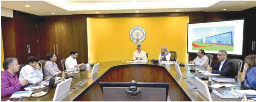
Chief Minister N Chandrababu Naidu chairs a review meeting on the CII Partnership Summit in Visakhapatnam, at the Secretariat on Monday

"The summit must strengthen global trust, drive trade partnerships, and highlight the state's role in the global tech trans-