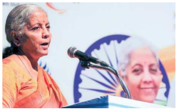
Union Finance Minister Nirmala Sitharaman addressing the joint conclave of the trade and industries association in Chennai on Sunday

KINSHASA: Over 200 people have been killed in two deadly boat accidents in two days in Democratic Republic of Congo. The most recent incident occurred a day ago and saw a boat with nearly 500 passengers catch fire and capsize on the Congo River, in the Equateur Province's Lukolela territory, authorities said. Some 107 people were killed and a further 146 are missing, the Congolese humanitarian affairs ministry said. It came a day after at least 86 people were killed in a separate boat accident in the Basankusu territory, in the same province. Most of those victims were said to have been students.