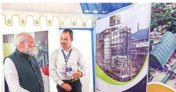
PM Narendra Modi during the inauguration of a refinery at Golaghat in Assam on Sunday

Signalling a major leap in Assam's healthcare sector, Modi unveiled projects worth Rs 6,300 crore in Darrang district. The projects include Darrang Medical College along with a nursing college and a GNM school in Mangaldai town. It also includes the 118.5 km-long Guwahati Ring Road project, connecting Kamrup and Darrang districts in Assam and Ri Bhoi in Meghalaya. The Prime Minister hailed the BJP government's work in Assam,