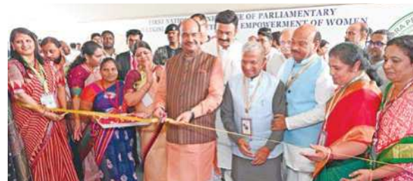
LS Speaker Om Birla inaugurating the National Conference of Parliamentary and Legislative Committees on Empowerment of Women in Tirupati on Sunday