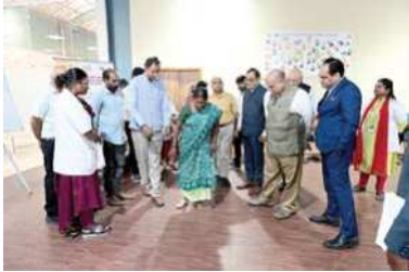
Artificial limbs distributed at Andhra Pradesh MedTech Zone (AMTZ) to persons with disabilities

The state-of-the-art bionic hand is a shining example of how Indian technology can transform lives. Recently, a woman in Visakhapatnam, who lost her arm in a road accident was attached with the prosthetic, opening new possibilities for independence. Thousands of people have already re-