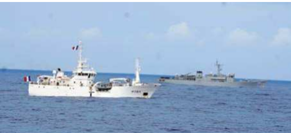
The ships of Indian Navy's first training squadron take part in bilateral engagements

participated in a PASSEX with the Floreal-class frigate FS Le Malin, which included coordinated manoeuvres, communication drills, and navigation exercises.