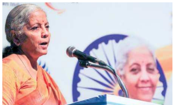
Union Finance Minister Nirmala Sitharaman addressing the joint conclave of the trade and industries association in Chennai on Sunday

KINSHASA: Over 200 people have been killed in two deadly boat accidents in two days in Democratic Republic of Congo. The most recent incident occurred a day ago and saw a boat with nearly 500 passengers catch fire and capsize on the Congo River, in the Equateur Province's Lukolela territory, authorities said. Some 107 people were killed and a further 146 are missing, the Congolese humanitarian affairs ministry said. It came a day after at least 86 people were killed in a separate boat accident in the Basankusu territory, in the same province. Most of those victims were said to have been students.