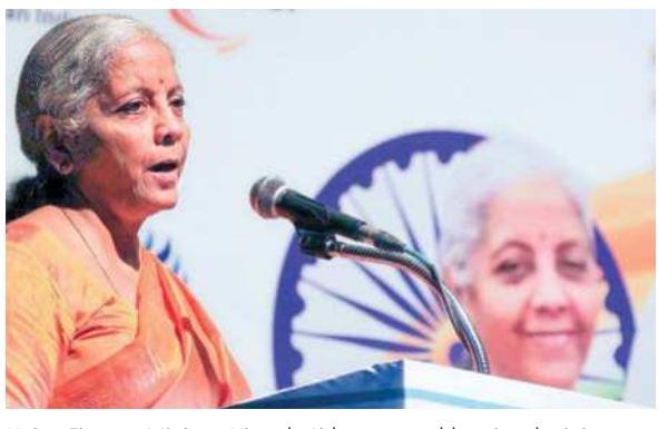
Union Finance Minister Nirmala Sitharaman addressing the joint conclave of the trade and industries association in Chennai on Sunday

KINSHASA: Over 200 people have been killed in two deadly boat accidents in two days in Democratic Republic of Congo. The most recent incident occurred a day ago and saw a boat with nearly 500 passengers catch fire and capsize on the Congo River, in the Equateur Province's Lukolela territory, authorities said. Some 107 people were killed and a further 146 are missing, the Congolese humanitarian affairs ministry said. It came a day after at least 86 people were killed in a separate boat accident in the Basankusu territory, in the same province. Most of those victims were said to have been students.