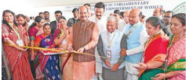
LS Speaker Om Birla inaugurating the National Conference of Parliamentary and Legislative Committees on Empowerment of Women in Tirupati on Sunday