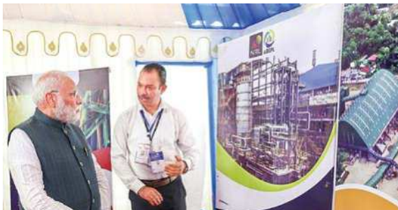
PM Narendra Modi during the inauguration of a refinery at Golaghat in Assam on Sunday

PRIME Minister Narendra Modi on Sunday launched a scathing attack on the Congress during a public meeting in Assam's Darrang district, alleging that the party has consistently sided with anti-national forces and even terrorists groomed by Pakistan. "Instead of standing with our brave soldiers, Congress has chosen to back infiltrators and those who threaten India's unity. This party has repeatedly provided cover to anti-national forces," PM Modi told the gathering at Mangaldai, adding that the BJP would not allow infiltrators to grab land or alter the state's demography. Signalling a major leap in Assam's healthcare sector, Modi unveiled projects worth Rs 6,300 crore in Darrang district. The projects include Darrang Medical College along with a nursing college and a GNM school in Mangaldai town. It also includes the 118.5 km-long Guwahati Ring Road project, connecting Kamrup and Darrang districts in Assam and Ri Bhoi in Meghalaya. The Prime Minister hailed the BJP government's work in Assam,