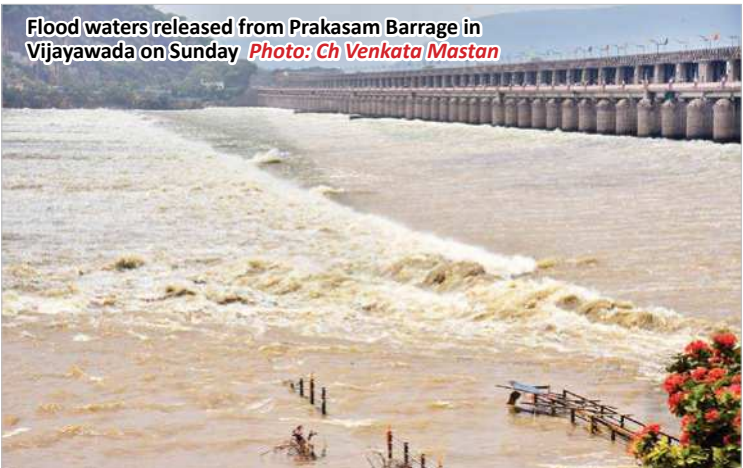
lakh cusecs into the sea. As per WRD officials, at 6 pm on Sunday, approximately 2,76,250 cusecs of water was released into the sea by opening the gates, while an additional 9,547 cusecs was diverted

DUE to significant inflows from upstream reservoirs, over 3 lakh cusecs of floodwater arrived at Prakasam Barrage here on Sunday. To manage water levels and ensure the safety of the barrage, officials from the Water Resources Department (WRD) opened 69 gates to discharge the surplus downstream into Krishna river. Persistent heavy rainfall in the catchment areas of Krishna river has resulted in substantial discharges from Srisaillam, Nagarjuna Sagar, and Pulichintala projects. Consequently, the Irrigation department redirected nearly the same amount—approximately 3