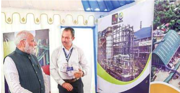
PM Narendra Modi during the inauguration of a refinery at Golaghat in Assam on Sunday

Signalling a major leap in Assam's healthcare sector, Modi unveiled projects worth Rs 6,300 crore in Darrang district. The projects include Darrang Medical College along with a nursing college and a GNM school in Mangaldai town. It also includes the 118.5 km-long Guwahati Ring Road project, connecting Kamrup and Darrang districts in Assam and Ri Bhoi in Meghalaya. The Prime Minister hailed the BJP government's work in Assam,