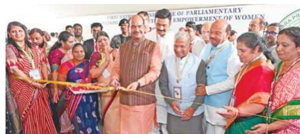
LS Speaker Om Birla inaugurating the National Conference of Parliamentary and Legislative Committees on Empowerment of Women in Tirupati on Sunday