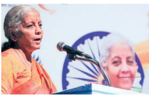
Union Finance Minister Nirmala Sitharaman addressing the joint conclave of the trade and industries association in Chennai on Sunday