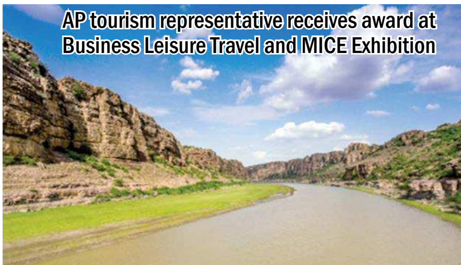
AP tourism representative receives award at Business Leisure Travel and MICE Exhibition

The state's tourism department showcased its diverse offerings, including heritage sites, pristine beach destinations, rural tourism experiences, and eco-tourism initiatives, at the event held from Friday to Sunday at Yashobhoomi, India International Convention Centre (IICC). Gandikota, known as