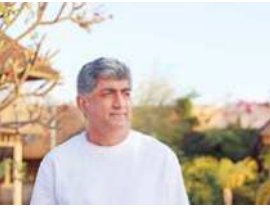
AIR ATMAN IN RAVI

LETTING go is an art in itself, an art we must master if we wish to be truly happy. From letting go of myths and superstitions, to releasing people and negative emotions, to eventually letting go of the ego, life continuously demands that we let go in order to be peaceful and joyful.