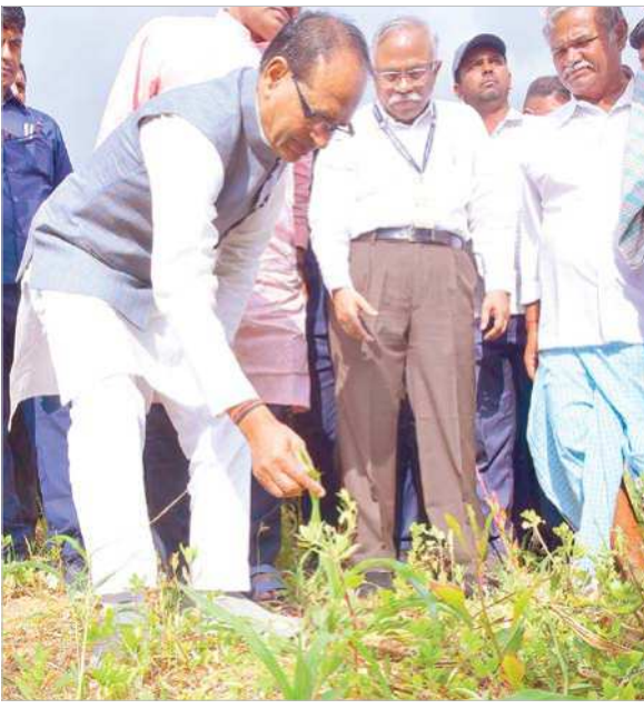
Union minister Shivraj Singh Chouhan inspects mixed crop field in Peaballi