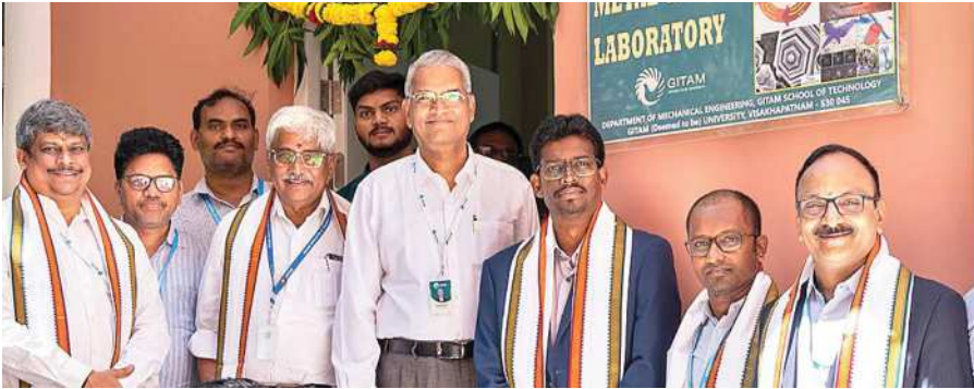
Officials from the Institution and ACMA after inaugurating the metal casting laboratory in Visakhapatnam on Thursday

IN a significant move to enhance practical experience and cutting-edge research opportunities for mechanical engineering students, GITAM Deemed to be University inaugurated the state-of-the-art metal casting laboratory here on Thursday. Automotive Component Manufacturers Association of India (ACMA) director