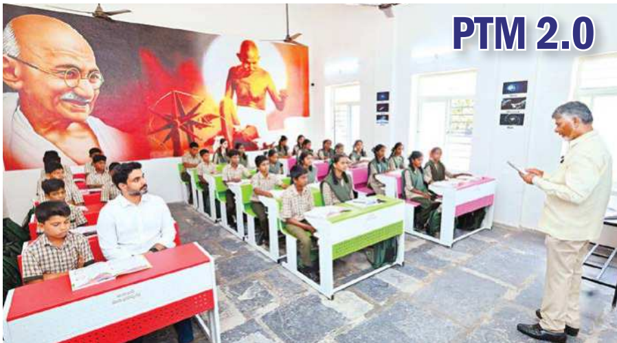
Chief Minister N Chandrababu Naidu becomes Social Science teacher for a class in Kothacheruvu ZP high school in Satyasai district during a mega Parent-Teacher Meeting on Thursday

Reflecting on the previous year's success when the first PTM was held across 44,000 government schools, the Chief Minister noted that this year's effort included private schools