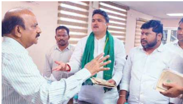
Tribal farmers of LK Thanda village under Gadi Vemula mandal of Nandyal district, supported by Girijana Praja Samakhya submit a memorandum against the alleged illegal occupation of their land by the company for its project, to Greenco Energy Development Corporation Ltd MD at its office in Tadepalli on Thursday

"GIVE us back our lands!" was the impassioned plea of tribal farmers from LK Thanda village as they submitted a representation to the managing director of Greenco Energy Development Corporation Limited here on Thursday. The farmers, supported by