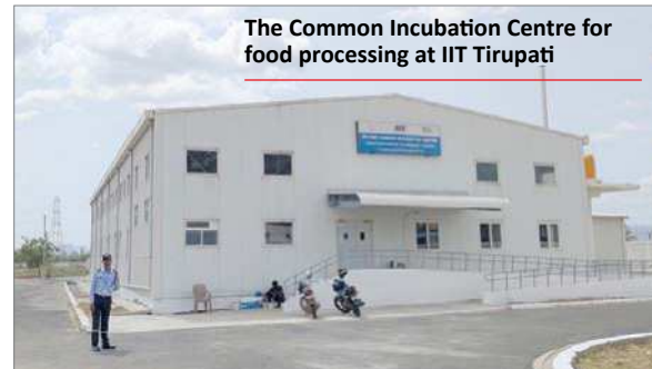
The Common Incubation Centre for food processing at IIT Tirupati

The centre at IIT Tirupati is focused on the processing of fruits and vegetables, and