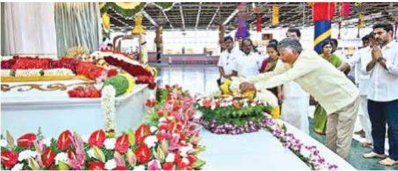
CM N Chandrababu Naidu pays respects to Sri Sathya Sai Baba at Maha Samadhi at Prasanthi Nilayam in Puttaparthi on Thursday

CHIEF Minister N Chandrababu Naidu visited the Maha Samadhi of Sri Sathya Sai Baba at Prasanthi Nilayam in Puttaparthi and paid respects to the spiritual icon. The visit followed his participation in a Mega Parent-Teachers Meeting in Kothacheruvu. At Prasanthi Nilayam, the CM was accompanied by Union minister for agriculture and farmers welfare, Shivraj Singh Chouhan, as they jointly offered prayers at the Samadhi of the revered spiritual leader. During the visit, the Chief Minister and state IT and education minister Nara Lokesh conducted a review meeting