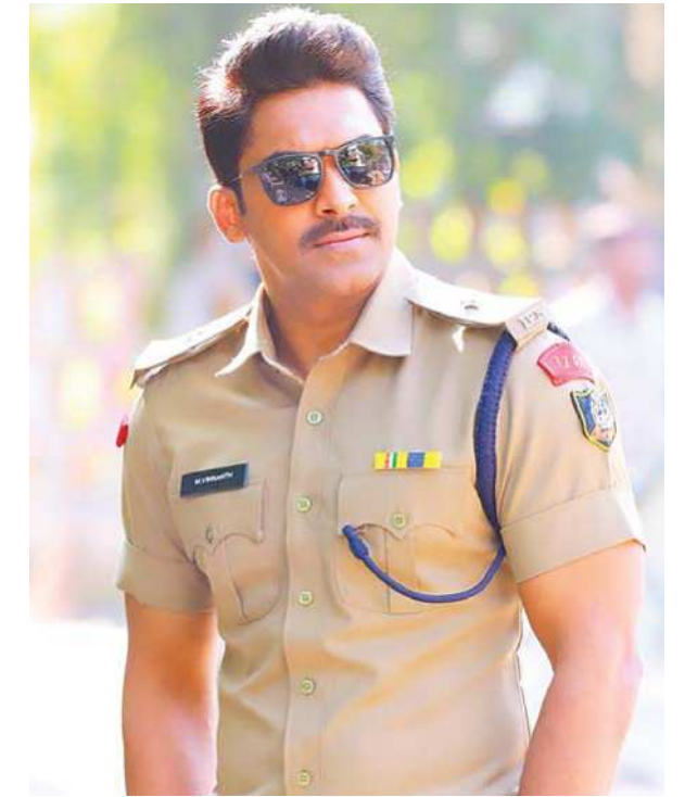
all while maintaining a tight grip on its investigative

At its core, 'The 100' follows Vikranth, a principled and determined IPS officer, as he unravels a complex case rooted in reality. The film is more than a regular whodunit-it seamlessly layers family dynamics, emotional depth, and socially relevant themes,