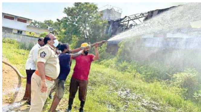
Police and Fire department staff controlling the flames in a foam making unit in Eluru on Thursday