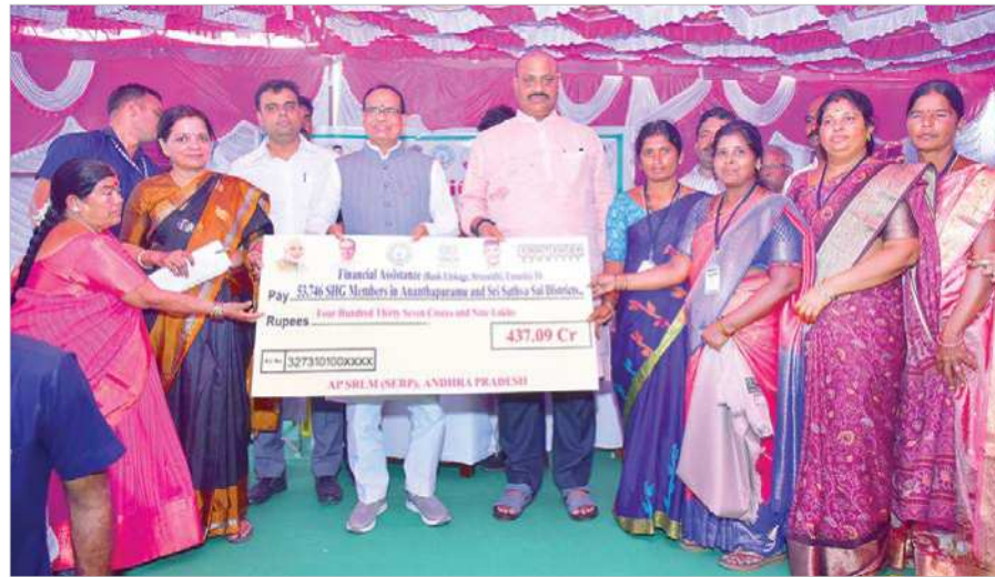
Union minister for agriculture, farmers welfare, and rural development Shivraj Singh Chouhan along with state agriculture minister K Atchannaidu hands over a bank linkage cheque for Rs 437.09 crore to be distributed to 53,746 SHG members from Puttaparthi, Anantapur and other parts of the undivided district, at a programme at Pedaballi in Puttaparthi mandal on Thursday

He recalled launching the 'Ladli Behna Yojana' during his tenure as Chief Minister of Madhya Pradesh, underscoring his