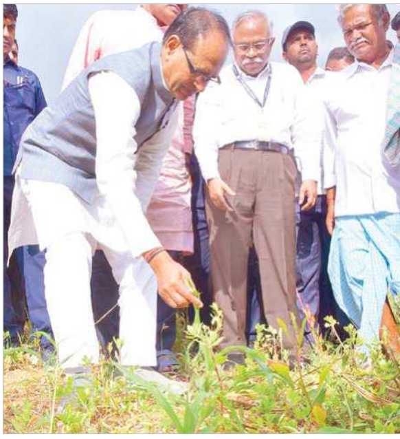
Union minister Shivraj Singh Chouhan inspects mixed crop field in Peaballi