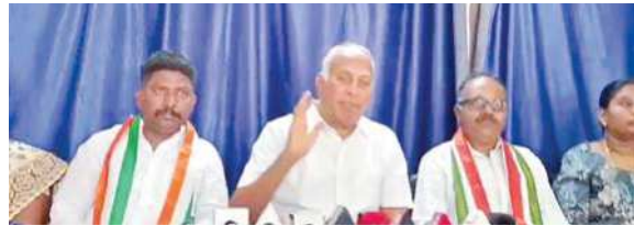
Senior Congress leader and former Union Minister Dr Chinta Mohan speaking to the media in Tirupati on Thursday