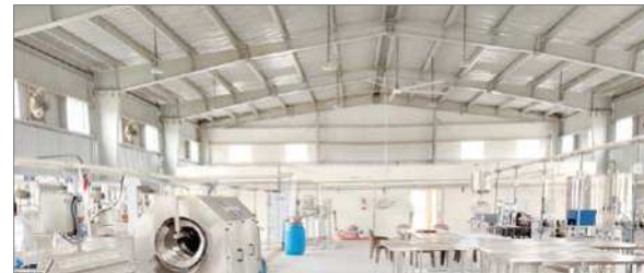
A view inside the facility