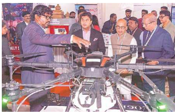
Union Minister for Communications Jyotiraditya Scindia during the inauguration of VTU-VRIF-TCOE Hub and Spoke Centre of Excellence in Bengaluru on Thursday

NO other distribution channel in the world is as wide or as deep as India Post, said Union Minister for Communication Jyotiraditya M Scindia on Thursday. He urged the postal employees to work towards becoming the largest logistics organisation in the world, too. Scindia was addressing the Gramin Dak Sevaks Sammelan at K P Puttana Chetty Town Hall in Bengaluru. “India post has 1.64 lakh points of presence, from Kashmir to Kanyakumari, from Bharuch to Tawang,” he added. He said, although the post offices are getting modern tools, like handheld devices and Darpan, postal employees need to change the way they work