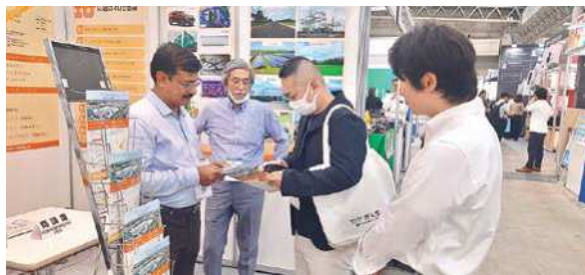
Interactive discussions underway between Sri City officials and stall visitors during the event in Japan