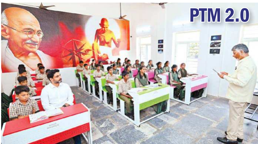
Chief Minister N Chandrababu Naidu becomes Social Science teacher for a class in Kothacheruvu ZP high school in Satyasai district during a mega Parent-Teacher Meeting on Thursday

Reflecting on the previous year's success when the first PTM was held across 44,000 government schools, the Chief Minister noted that this year's effort included private schools