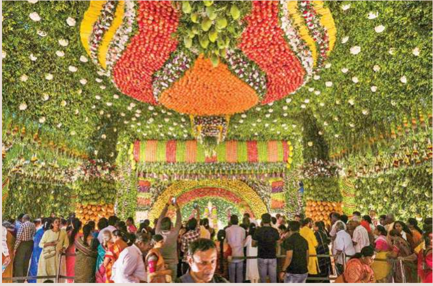
Sri Sai Spiritual Centre decorated with fruits and vegetables on the occasion of "Guru Purnima" festival, in Bengaluru on Thursday

Elections are not held in Congress, but the BJP follows democracy', he said.