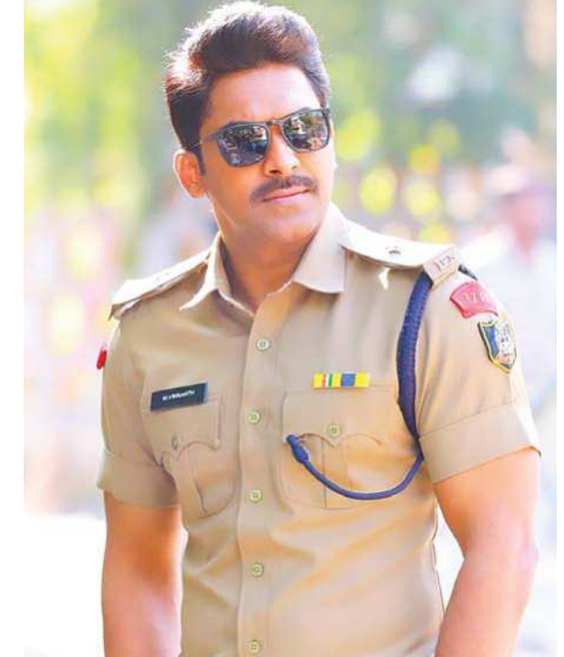
all while maintaining a tight grip on its investigative narrative. The thrilling

At its core, 'The 100' follows Vikranth, a principled and determined IPS officer, as he unravels a complex case rooted in reality. The film is more than a regular whodunit-it seamlessly layers family dynamics, emotional depth, and socially relevant themes,