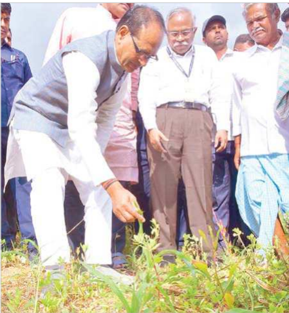
Union minister Shivraj Singh Chouhan inspects mixed crop field in Peaballi