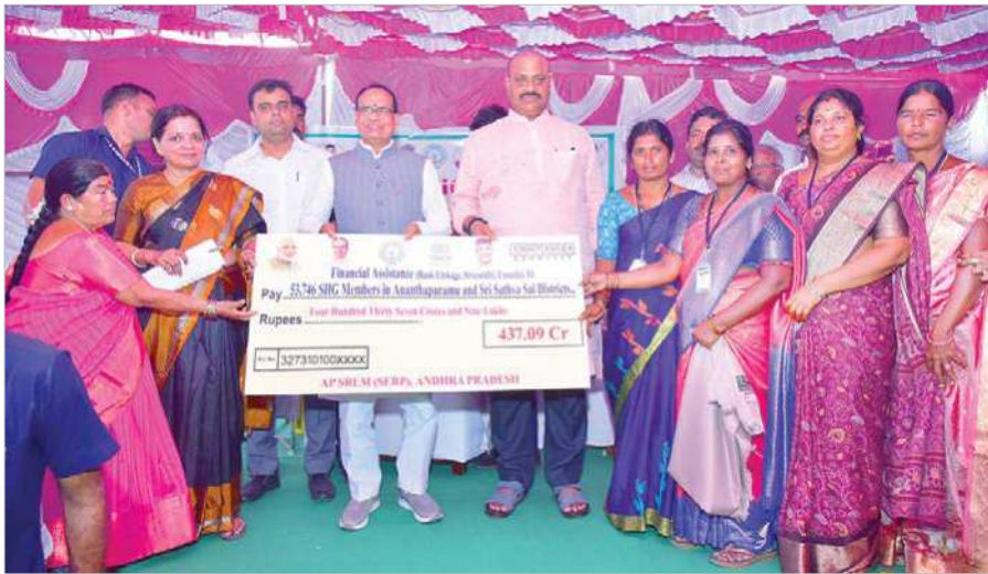
Union minister for agriculture, farmers welfare, and rural development Shivraj Singh Chouhan along with state agriculture minister K Atchannaidu hands over a bank linkage cheque for Rs 437.09 crore to be distributed to 53,746 SHG members from Puttaparthi, Anantapur and other parts of the undivided district, at a programme at Pedaballi in Puttaparthi mandal on Thursday

Union minister appreciated the natural farming methods suggested by district collector Chetan, stating: "Natural farming involves lower costs and higher profits. It can become a model for the nation. By using modern technology, higher yields can be achieved even on small landholdings, opening many opportunities for small-scale farmers." On women empowerment, minister Chouhan praised the efforts of SHG women, highlighting their progress: "Our sisters are becoming self-reliant and stepping forward to lead dignified lives without depending on others. Their commitment to overcoming poverty and standing tall in society is commendable." He recalled launching the 'Ladli Behna Yojana' during his tenure as Chief Minister of Madhya Pradesh, underscoring his