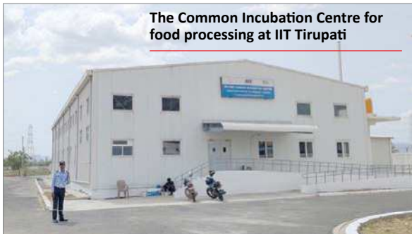
The Common Incubation Centre for food processing at IIT Tirupati

A state-of-the-art Common Incubation Centre (CIC) for food processing, established at the Indian Institute of Technology (IIT) Tirupati at a cost of Rs 3 crore, is set to be inaugurated on July 13. The facility will be formally launched by Union Minister for Food Processing Industries Chirag Paswan, alongside Andhra Pradesh Minister for Industries, Commerce, and Food Processing, TG Bharath. The incubation centre has been developed under the Ministry of Food Processing Industries (MoFPI), Government of India, as part of the Pradhan Mantri Formalisation of Micro Food Processing Enterprises (PMFME) scheme. It is one of 76 such centres being established across the country with a total outlay of Rs 205.95 crore. The centre at IIT Tirupati is focused on the processing of fruits and vegetables, and