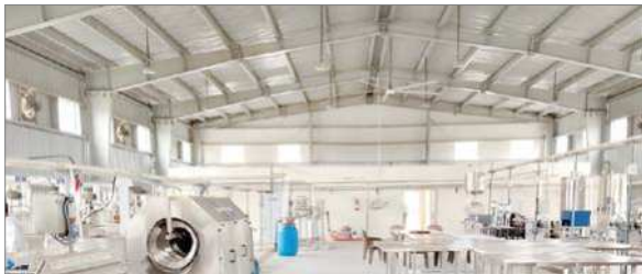
A view inside the facility