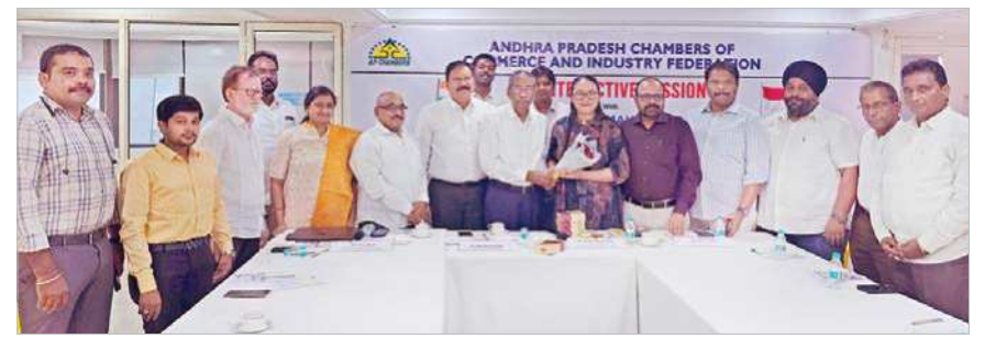
Mahatma Devi from the Embassy of Indonesia with the members of Andhra Pradesh Chambers of Commerce and Industry Federation in Vijayawada on Thursday

This is despite Indonesia being a significant importer of corn starch from both countries. Unfortunately, Indian-origin corn starch (HS Code: 11081200) is excluded from the ASEAN-India Free Trade Agreement (AIFTA) preferential tariff list, placing Indian export-