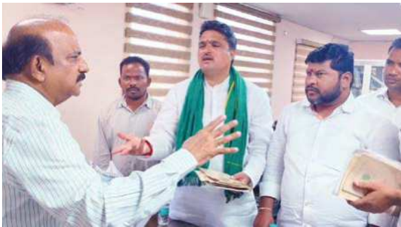
Tribal farmers of LK Thanda village under Gadi Vemula mandal of Nandyal district, supported by Girijana Praja Samakhya submit a memorandum against the alleged illegal occupation of their land by the company for its project, to Greenco Energy Development Corporation Ltd MD at its office in Tadepalli on Thursday

"GIVE us back our lands!" was the impassioned plea of tribal farmers from LK Thanda village as they submitted a representation to the managing director of Greenco Energy Development Corporation Limited here on Thursday. The farmers, supported by