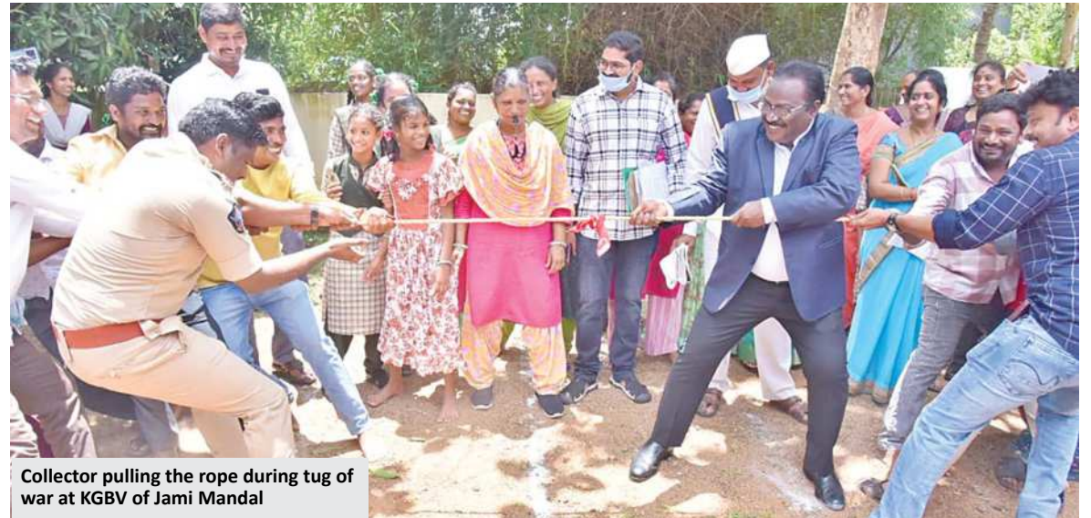
Collector pulling the rope during tug of war at KGBV of Jami Mandal

grades in the upcoming exams. The event included fun competitions for parents, such as rangoli, lemon-and-spoon races, and tug-of-war, in which the Collector himself participated. He concluded the event by awarding prizes and sharing a mid-day meal with students and their families.