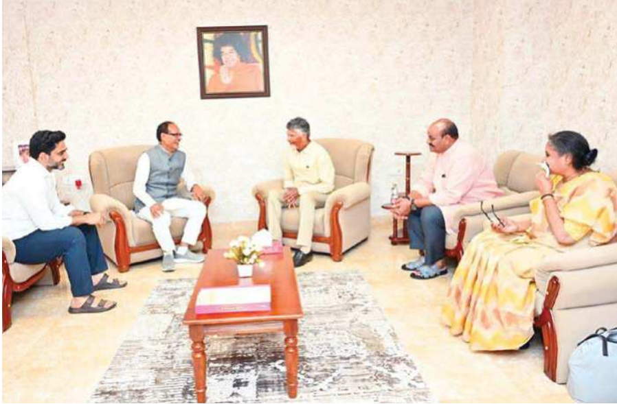
Union Minister Shivraj Singh Chouhan meets CM Chandrababu Naidu after holding a review meeting on drought-hit AP districts on Thursday

Chouhan agreed to develop a comprehensive and sustainable action plan for the state. He announced that a central team comprising scientists and officials from the Ministry of Agriculture, ICAR (Indian Council of Agricultural Research), the Ministry of Rural Development, and the Department of Land Resources (including Watershed Development) will soon visit the drought-hit districts. This team will work in coordination with the AP Agriculture Department and