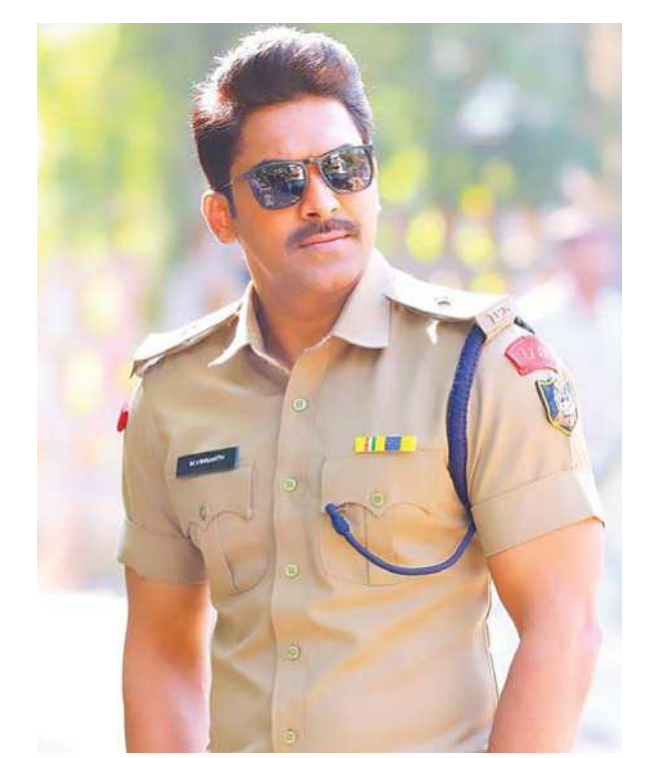
all while maintaining a tight grip on its investigative narrative. The thrilling

At its core, 'The 100' follows Vikranth, a principled and determined IPS officer, as he unravels a complex case rooted in reality. The film is more than a regular whodunit—it seamlessly layers family dynamics, emotional depth, and socially relevant themes,