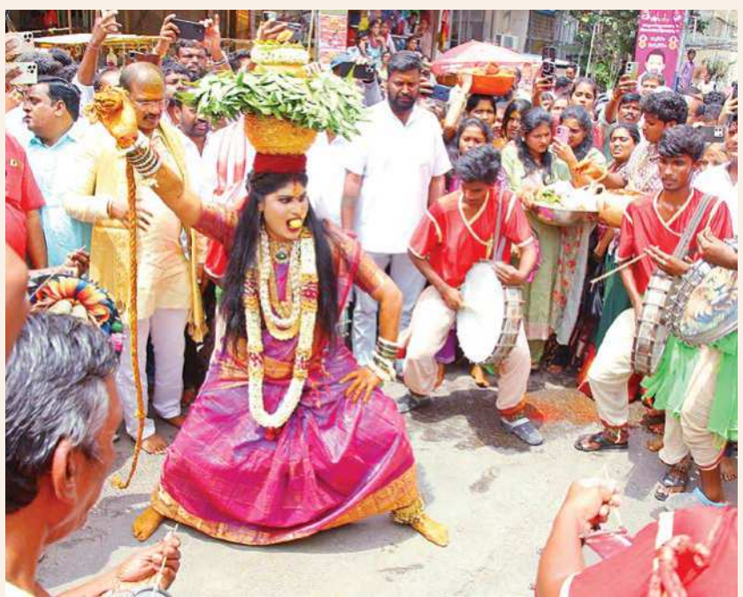
A jogini offering a golden bonam to Ujjaini Mahankali temple in Secunderabad on Thursday.

It also sought information on preventive mechanisms currently in place to regulate toddy tapping and distribution, and to monitor and curb adulteration of toddy to avoid recurrence of such incidents.