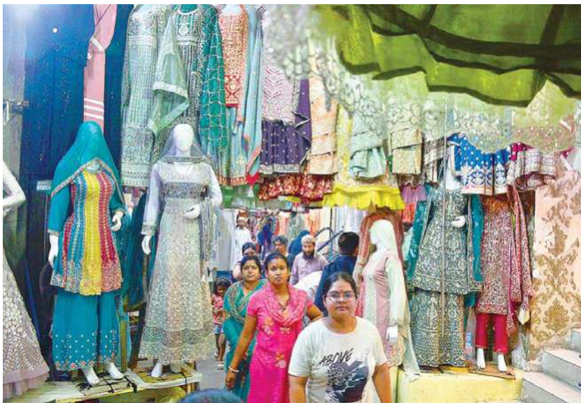
Women seen at Patthargatti, an iconic shopping hub for clothes, pearls and jewellery on Thursday.