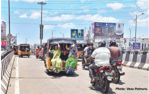
An overloaded auto-rickshaw plying passengers from Simhachalam in Visakhapatnam on Thursday