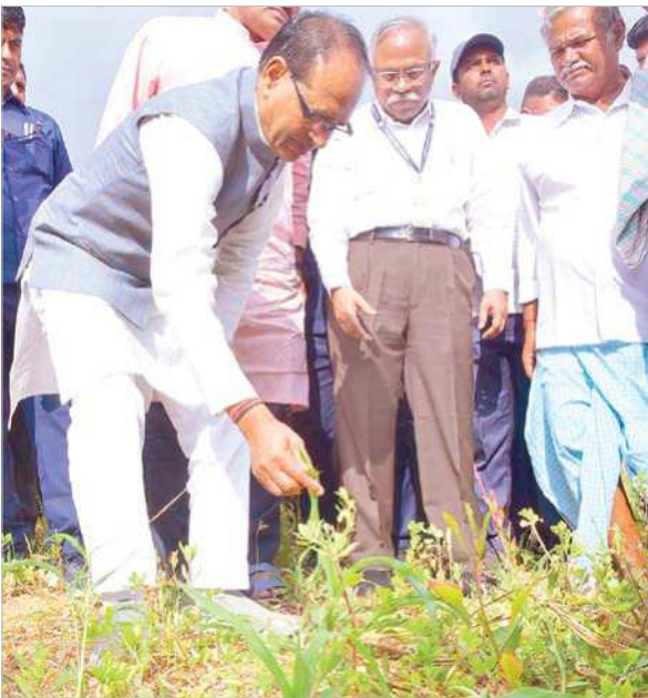
Union minister Shivraj Singh Chouhan inspects mixed crop field in Peaballi