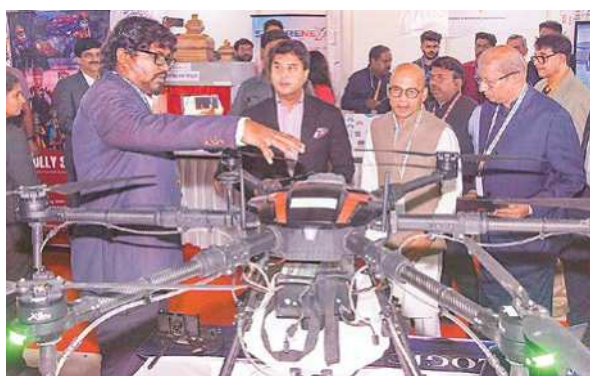
Union Minister for Communications Jyotiraditya Scindia during the inauguration of VTU-VRIF-TCOE Hub and Spoke Centre of Excellence in Bengaluru on Thursday

NO other distribution channel in the world is as wide or as deep as India Post, said Union Minister for Communication Jyotiraditya M Scindia on Thursday. He urged the postal employees to work towards becoming the largest logistics organisation in the world, too. Scindia was addressing the Gramin Dak Sevaks Sammelan at K P Puttana Chetty Town Hall in Bengaluru. "India post has 1.64 lakh points of presence, from Kashmir to Kanyakumari, from Bharuch to Tawang," he added. He said, although the post offices are getting modern tools, like handheld devices and Darpan, postal employees need to change the way they work