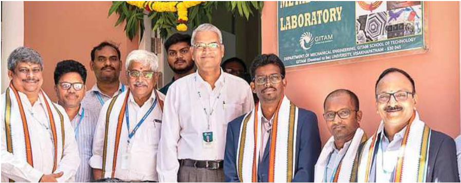
Officials from the Institution and ACMA after inaugurating the metal casting laboratory in Visakhapatnam on Thursday