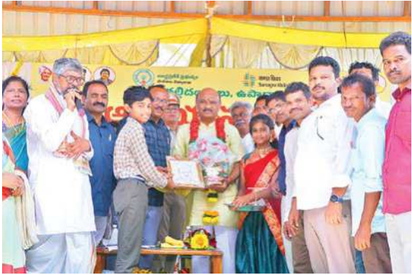
Assembly Speaker Chintakayala Ayyanna Patrudu at the parent teacher meeting held in Anakapalli district on Thursday