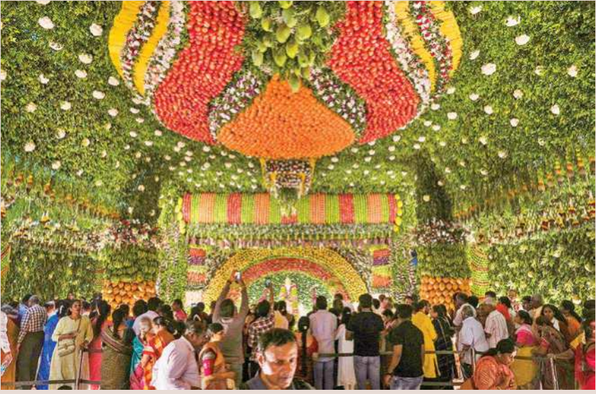
Sri Sai Spiritual Centre decorated with fruits and vegetables on the occasion of "Guru Purnima" festival, in Bengaluru on Thursday

Elections are not held in Congress, but the BJP follows democracy', he said.