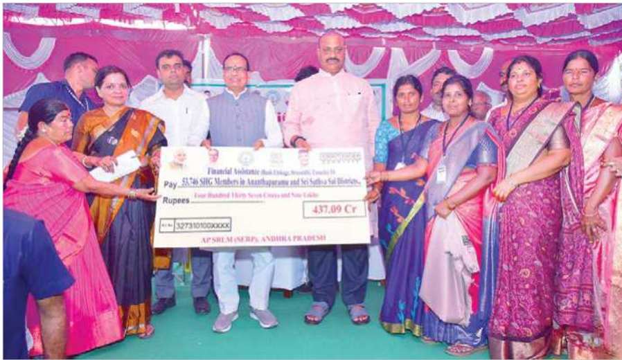
Union minister for agriculture, farmers welfare, and rural development Shivraj Singh Chouhan along with state agriculture minister K Atchannaidu hands over a bank linkage cheque for Rs 437.09 crore to be distributed to 53,746 SHG members from Puttaparthi, Anantapur and other parts of the undivided district, at a programme at Pedaballi in Puttaparthi mandal on Thursday

Union minister appreciated the natural farming methods suggested by district collector Chetan, stating: "Natural farming involves lower costs and higher profits. It can become a model for the nation. By using modern technology, higher yields can be achieved even on small landholdings, opening many opportunities for small-scale farmers." On women empowerment, minister Chouhan praised the efforts of SHG women, highlighting their progress: "Our sisters are becoming self-reliant and stepping forward to lead dignified lives without depending on others. Their commitment to overcoming poverty and standing tall in society is commendable." He recalled launching the 'Ladli Behna Yojana' during his tenure as Chief Minister of Madhya Pradesh, underscoring his