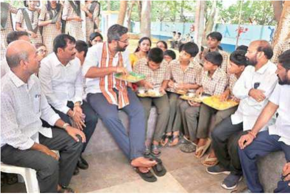
Visakhapatnam MP M Sriharat interacting with school children in Visakhapatnam on Thursday