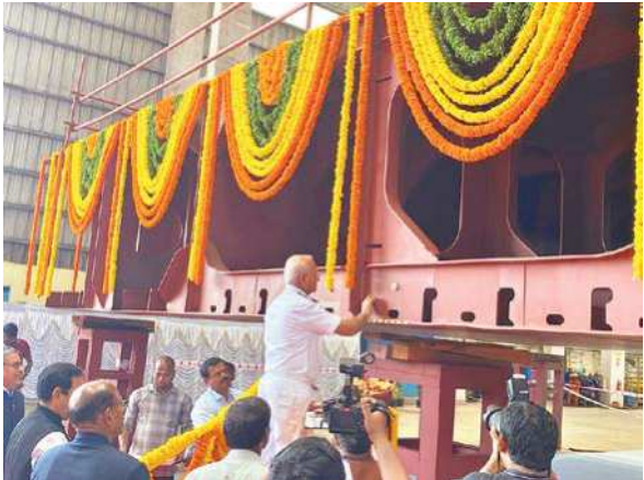
Keel laying ceremony of the third of the five ordered Fleet Support Ships held at L&T Shipyard, Kattupalli

highlights HSL’s enhanced project execution capability and coordination across multiple shipbuilding sites. From building small auxiliary vessels to delivering strategic platforms like INS Dhruv and Nistar, HSL has made a transformational leap in technology, engineering precision and expertise. With five FSS vessels underway and upgraded infrastructure including a 300T Goliath crane and refurbished slipway, HSL is firmly positioned to meet future naval needs including LPDs and next-generation platforms. Expressing gratitude to the Indian Navy for their continued support and to L&T Shipyard for their partnership on FSS-2 and FSS-3, the C&MD, HSL affirmed that HSL is rising confidently despite challenges and setting new benchmarks in India’s strategic shipbuilding domain.