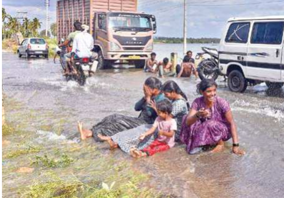
Locals enjoy water from the swollen Belavadi lake flowing through a road in Chikkamagaluru district on Thursday