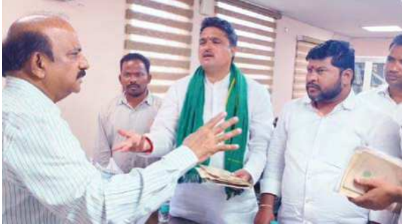
Tribal farmers of LK Thanda village under Gadi Vemula mandal of Nandyal district, supported by Girijana Praja Samakhya submit a memorandum against the alleged illegal occupation of their land by the company for its project, to Greenco Energy Development Corporation Ltd MD at its office in Tadepalli on Thursday

'GIVE us back our lands!' was the impassioned plea of tribal farmers from LK Thanda village as they submitted a representation to the managing director of Greenco Energy Development Corporation Limited here on Thursday. The farmers, supported by