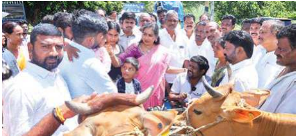
Home Minister Vangalapudi Anitha handing over Jersey cows to a couple suffering from financial constraints at S. Rayavaram mandal in Anakapalli on Thursday