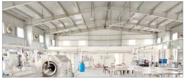
A view inside the facility