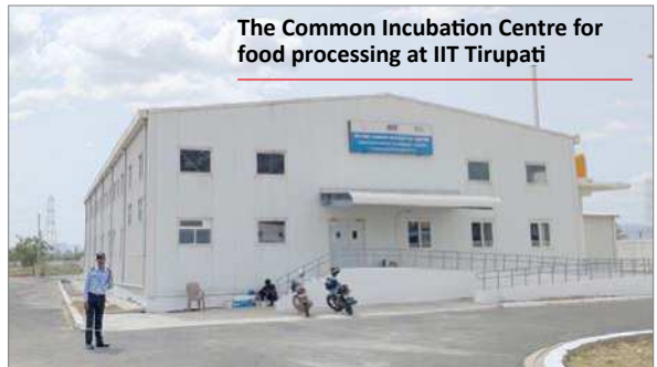
The Common Incubation Centre for food processing at IIT Tirupati

A state-of-the-art Common Incubation Centre (CIC) for food processing, established at the Indian Institute of Technology (IIT) Tirupati at a cost of Rs 3 crore, is set to be inaugurated on July 13. The facility will be formally launched by Union Minister for Food Processing Industries Chirag Paswan, alongside Andhra Pradesh Minister for Industries, Commerce, and Food Processing, TG Bharath. The incubation centre has been developed under the Ministry of Food Processing Industries (MoFPI), Government of India, as part of the Pradhan Mantri Formalisation of Micro Food Processing Enterprises (PMFME) scheme. It is one of 76 such centres being established across the country with a total outlay of Rs 205.95 crore. The centre at IIT Tirupati is focused on the processing of fruits and vegetables, and