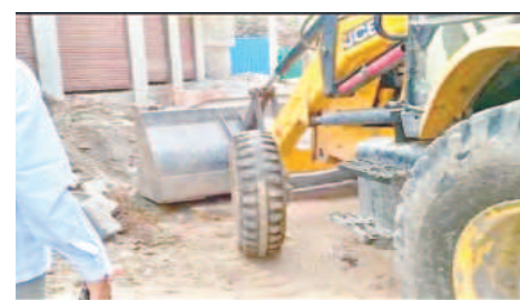
Municipal officials demolishing the steps of a shopping complex in Kodad town on Monday

The shopping complex belongs to BJP leader Orsu Velangi Raju