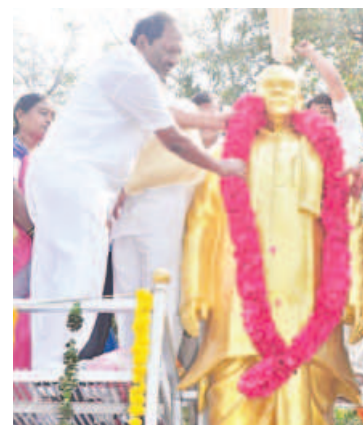
Welfare Minister Koppula Eshwar garlanding the statue of former Minister late Juvvadi Ratnakar Rao after unveiling it in Dharmapuri on Monday