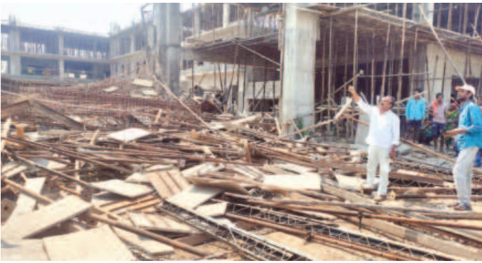
Construction site where centring collapsed in Mahabubabad on Monday