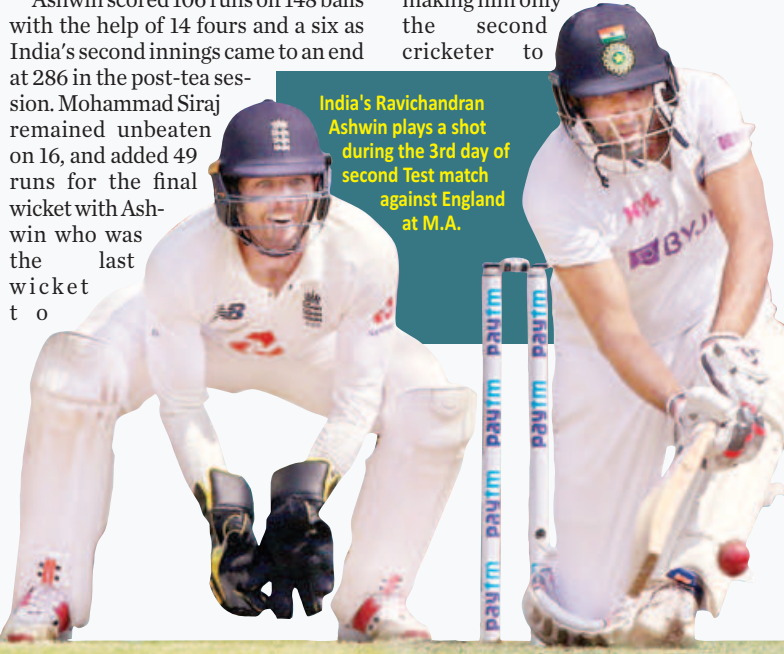
India's Ravichandran Ashwin plays a shot during the 3rd day of second Test match against England at M.A.

India had posted 329 runs in their first innings. The hosts then bowled