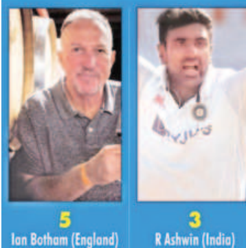
5 Ian Botham (England) 3 R Ashwin (India)