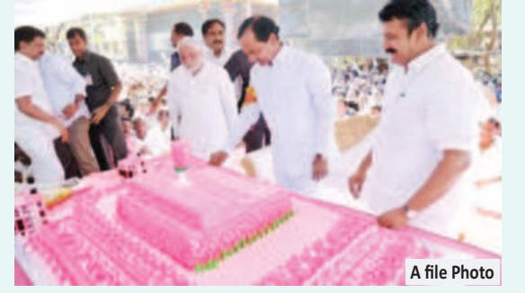
A file Photo

The film is directed by popular director Bandook Lakshman. The first view of this short film will be presented at a public meeting