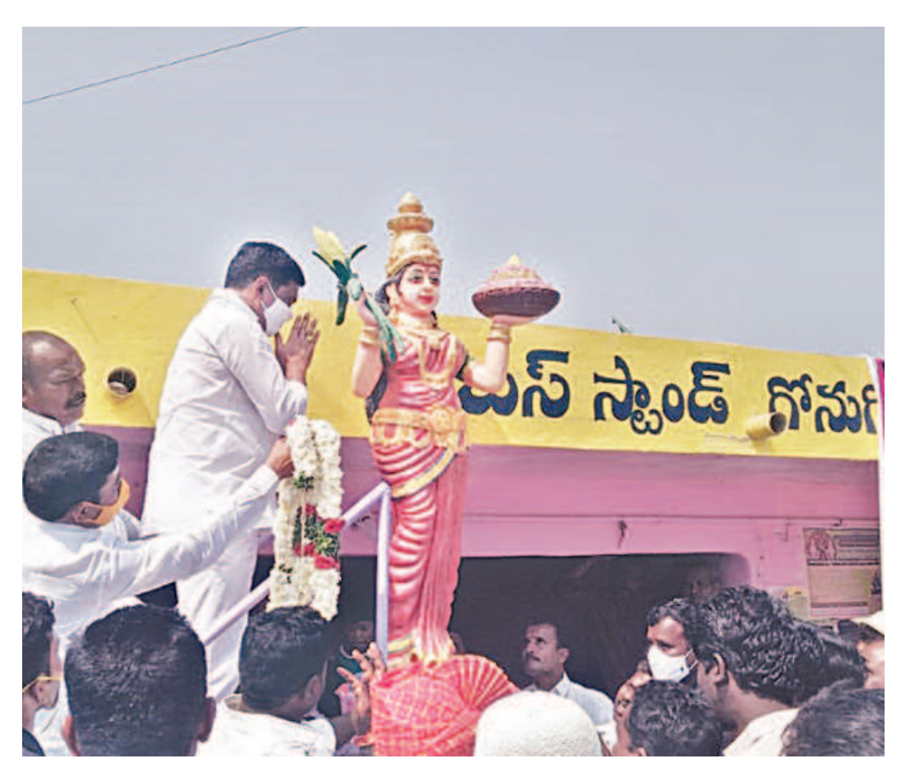
R&B and Legislative Affairs Minister Vemula Prashanth Reddy garlanding Telangana Thalli idol in Balkonda on Monday

Later, the Minister participated in the official Jayanti function of Sevalal